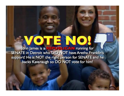
Figure 1. Kavanaugh-themed tweet that contains call to action.

PLEASE GO TO https://www.270towin.com/2018-senate-election/... to learn more about YOUR state and who is running. Do what you can to get the RIGHT PERSON for your family and values elected. #BlackTwitter#Vote #BlackVote #TaylorSwift#iHeartOnCW #TheWalkingDead#90DayFiance#Kavanaughpic.