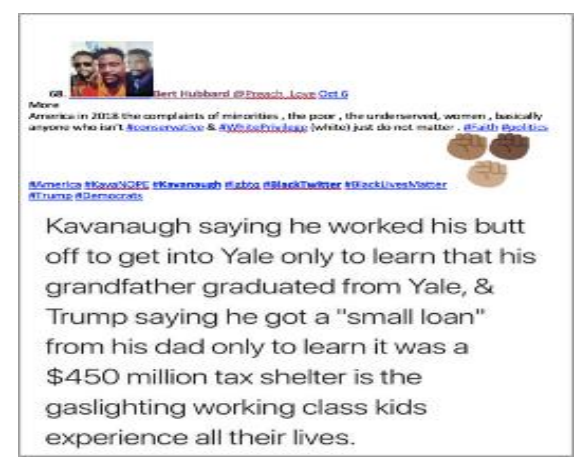
Figure 6. Kavanaugh-themed tweet illustrating the white privilege frame.

@Yamiche @Capehart] @realDonaldTrump supporters #Republican always screaming abt #Elite s yet #Kavanaugh #Kavanaughvote member of elite all male dinner club. @amjoyshow @CNN @MSNBC @FoxNews as well as #Trump #cabinet full of extreme wealth and corporate influence. #BlackTwitter. #Corruption