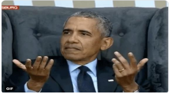
Figure 4. Blame for Black Twitter in Kavanaugh-themed tweets

Omg...how far does someone's head have to be up their butt to blame "black twitter" for Kavanaugh? The pinching must cut off circulation to the brain.