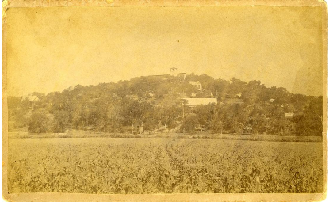
View of the Tabernacle on top of Chautauqua Hill. A few tents are located on the hill, and corn crops are growing at the base of the hill.