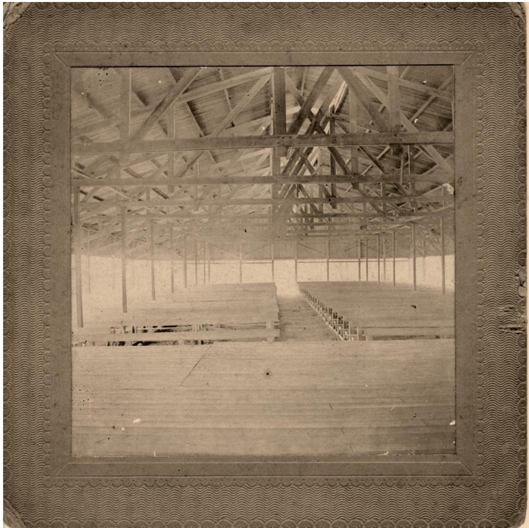
View of the inside of the Tabernacle located on Chautauqua Hill.