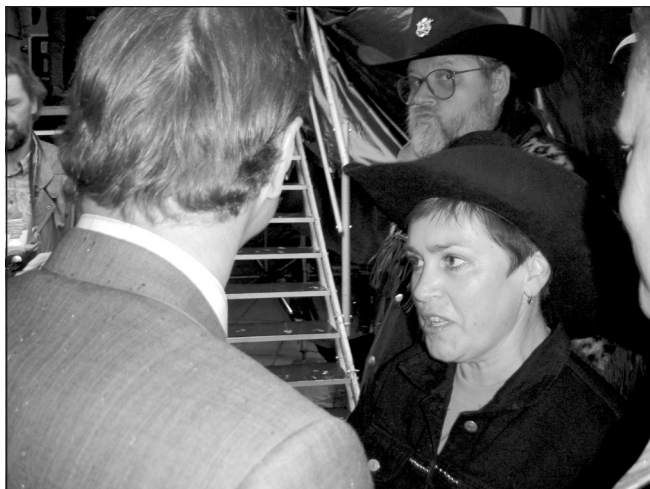
Elena Čekiene and former Lithuanian President Rolandas Paksas

munist party. Moscow brought in thousands of ethnic Russian workers to Snieckus in order to populate the town and staff the power plant. Many local Lithuanians resented this large Russian presence in the region as an uncomfortable reminder of what they considered Soviet colonialism. When Lithuania regained its independence from the Soviet Union in 1991, the town came to symbolize the cultural and political resurgence of Lithuanians.