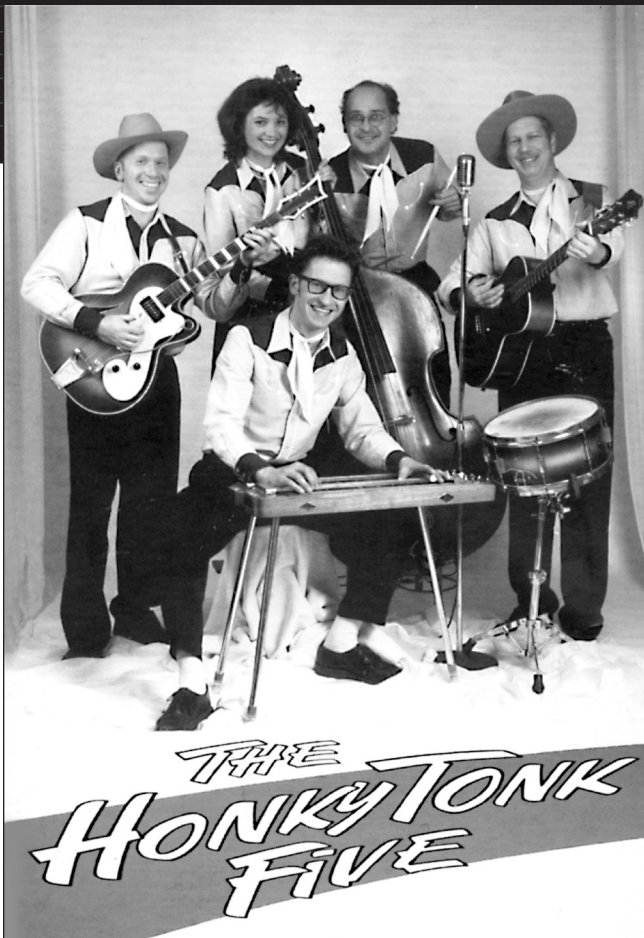
The Honky Tonk Five

the years to feature a variety of bands at the Oklahoma and the Rattlesnake Saloon that reflect this diversity, including bluegrass, honky tonk, “outlaw,” western swing, cajun, rockabilly, country, and country rock.