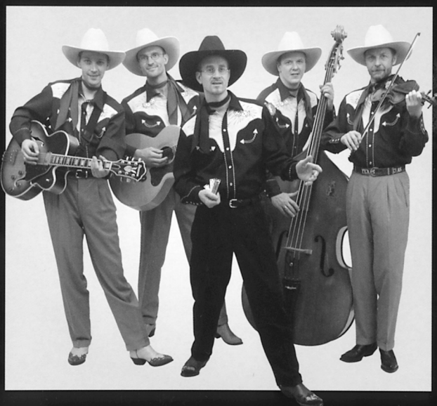
Hillbilly & Western Swing

swing, rockabilly, honky tonk, and other forms of roots music, discussed at length how Texas music and Texas musicians have a distinctive sound, because of the cultural cross pollination of so many different ethnic groups in the Southwest. 9 Another French publication, Rock and Roll Revue , carries articles on rockabilly that emphasize how diverse artists and influences from Texas helped shaped early rock and roll. 10