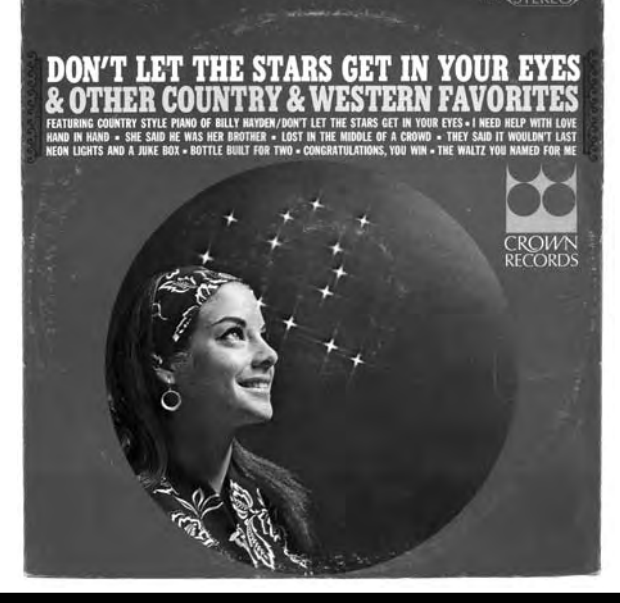
LP cover highlighting "Stars."

composition as "No Hay Que Dejarse Ilusionar," which literally translates as "Don't Let Yourself Be Fooled."<sup>64</sup>