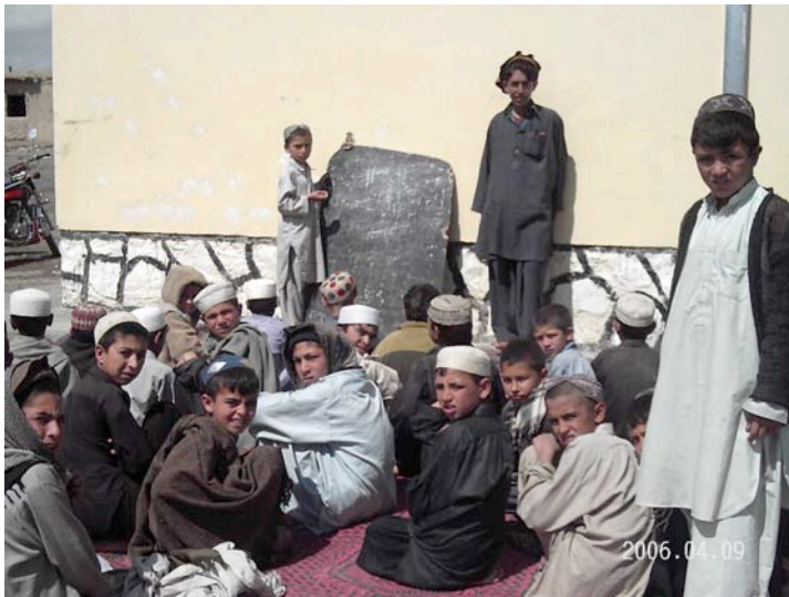
Young boys attend school outside. Due to heavy resistance for education by some groups, school buildings are being bombed, forcing kids to have class outside.