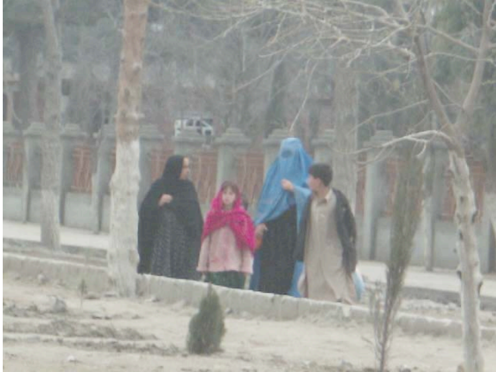
Afghan females walking freely down the street. Walking without a male escort is something women are able to do now.