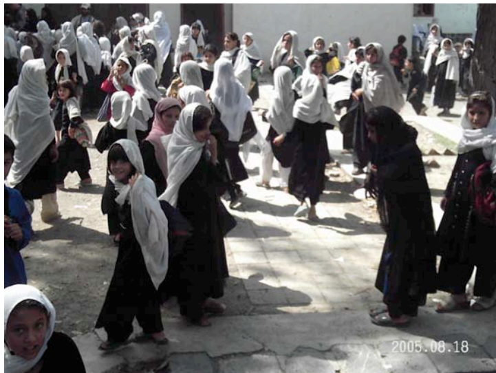
Young girls run outside during school. Since the fall of the Taliban, girls are given the opportunity to attend school.