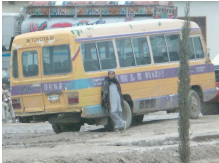
A young man stands against a brightly colored school bus. Education is slowly increasing for children in Afghanistan.