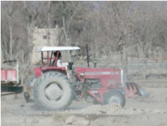
An Afghan male works in the field. It is rare to cultivate with machines, but the quicker they are plowed, the better for the people.