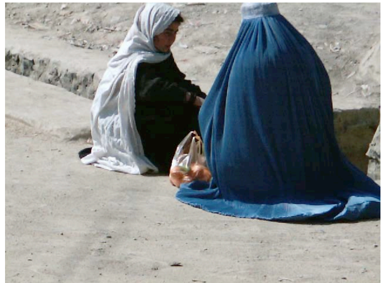
An Afghan woman sits with a young female on the side of a street. Most women must remain covered in the burqa.