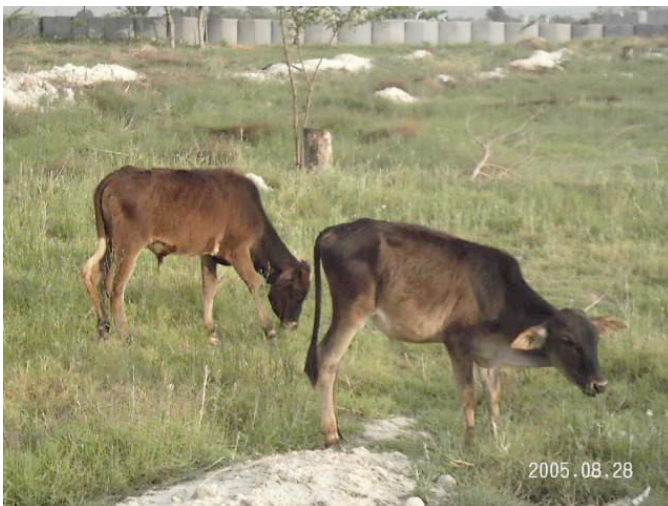
Cattle are raised, although it is rare that Afghans consume enough beef to meet daily protein requirements.