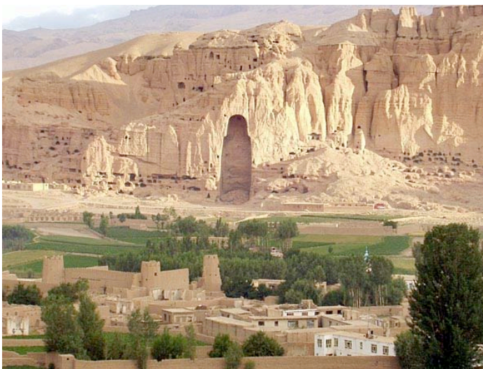
Manmade caves are seen within the mountains around Afghanistan. My father's missions called for him to search these caves and mountains.