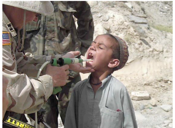
A young boy is dewormed by a United States soldier. Providing health aid is just one of the many forms of assistance provided by U.S. troops.