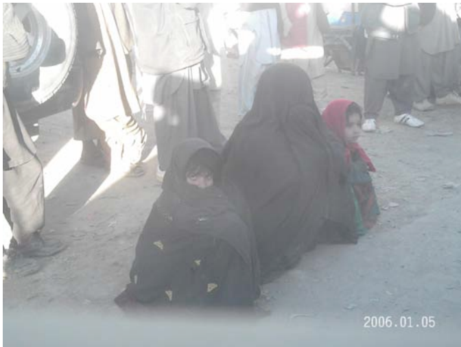
Afghan females rest on one side of the street. Most women were not allowed to have their pictures taken.