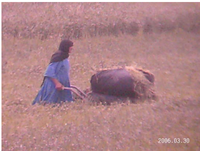
Afghan woman working out in the field. This is a right women are slowly regaining.