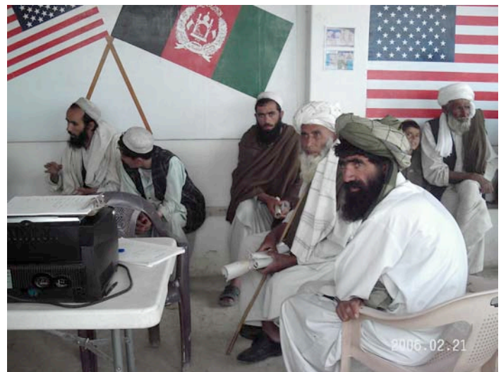
Cultural diversity, such as the Pashtuns, in Afghanistan.