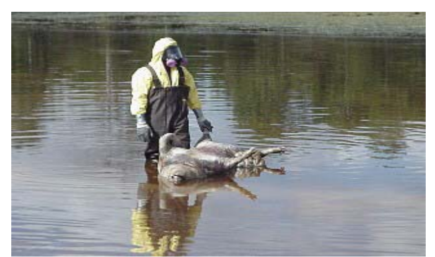
Contract clean-up worker with swine carcass, Hurricane Floyd aftermath, North Carolina, 1999

Problems encountered in the carcass disposal efforts (see Appendix C) included contamination of drinking water sources, fly control, odor control from excessive hydrogen sulfide (H<sub>2</sub>S), possible zoonotic (animal to human) disease introduction such as Leptospirosis, Salmonellosis, or Tetanus, and simple removal of the carcasses to nonflooded disposal sites (NCSUCE, 1999, p. 1-2, see Appendix C). Those problems were especially prevalent in areas of concentrated swine and poultry operations located on flood prone property, that may have previously been deemed unsuitable for other purposes.