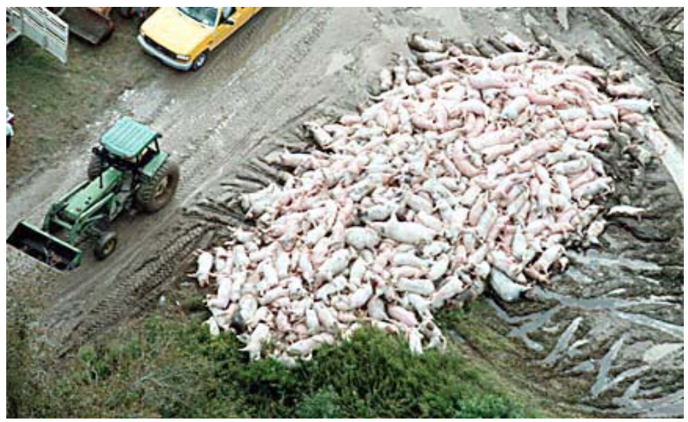
Swine carcasses prepared for burial, Hurricane Floyd aftermath, North Carolina, 1999.

inevitable. It quickly became evident that site selection and burial choice for animals drowned in the disaster elicited strong public opinion and emotions.