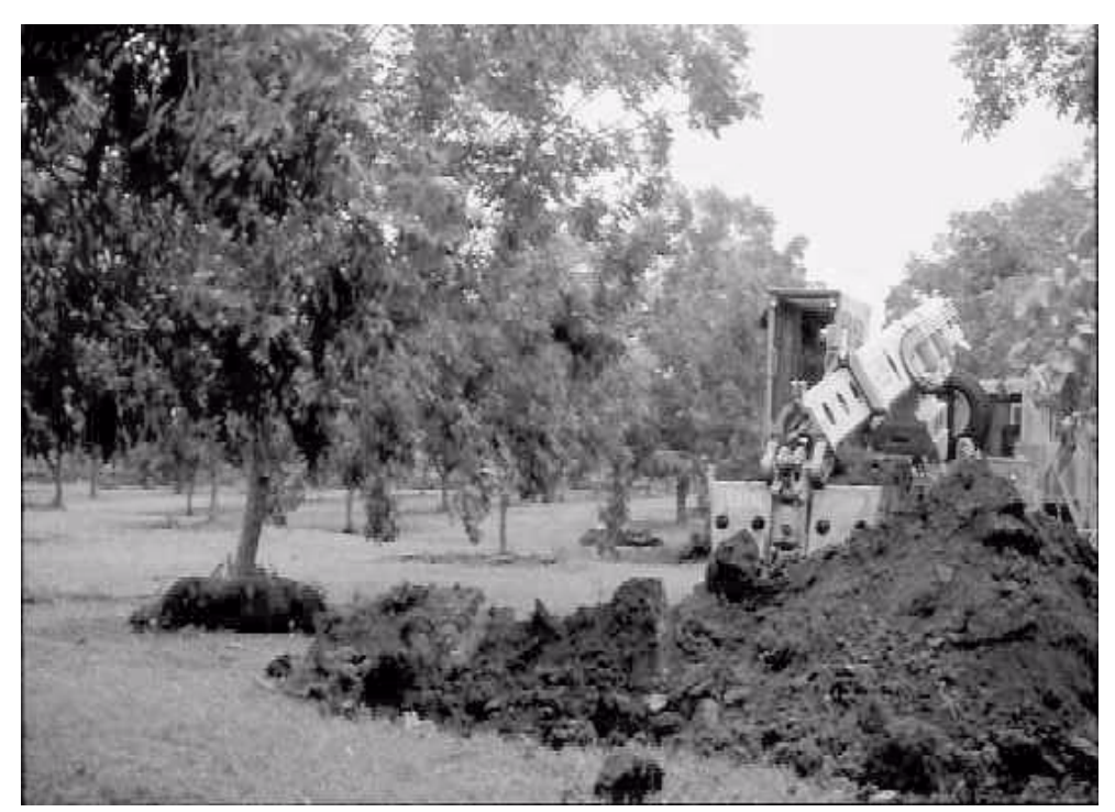
(Drowned cattle being buried in flooded orchard near Luling, Texas, Oct. '98)

Service, and the Texas Department of Transportation. Myriads of animal disaster issues were encountered such as identification and housing of stray livestock, capture and transportation of the same, as well as coordinating the disposal of the many large animal carcasses. Lower Colorado River Authority (LCRA - a pseudo-governmental agency) and local emergency response personnel played integral roles in coordinating the general debris removal and disposal process. Animal carcasses were generally considered as debris during the process, and were buried (where found if possible) or burned in air curtain incinerators along with other refuse. The laborious clean up process for animal carcasses took place over a two-week period in the 20 counties declared disaster areas (Wilson, TAHC internal report, 1998, & Ronsonette, 2001).