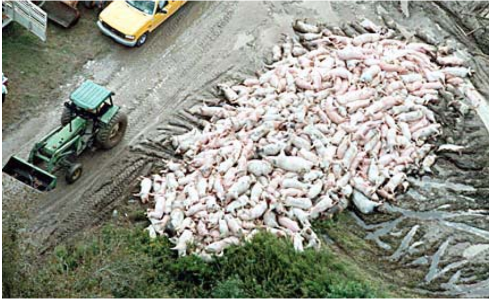
Swine carcasses prepared for burial, Hurricane Floyd aftermath, North Carolina, 1999.

inevitable. It quickly became evident that site selection and burial choice for animals drowned in the disaster elicited strong public opinion and emotions.