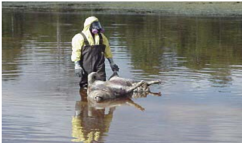
Contract clean-up worker with swine carcass, Hurricane Floyd aftermath, North Carolina, 1999

Problems encountered in the carcass disposal efforts (see Appendix C) included contamination of drinking water sources, fly control, odor control from excessive hydrogen sulfide (H 2 S), possible zoonotic (animal to human) disease introduction such as Leptospirosis, Salmonellosis, or Tetanus, and simple removal of the carcasses to non-flooded disposal sites (NCSUCE, 1999, p. 1-2, see Appendix C). Those problems were especially prevalent in areas of concentrated swine and poultry operations located on flood prone property, that may have previously been deemed unsuitable for other purposes.