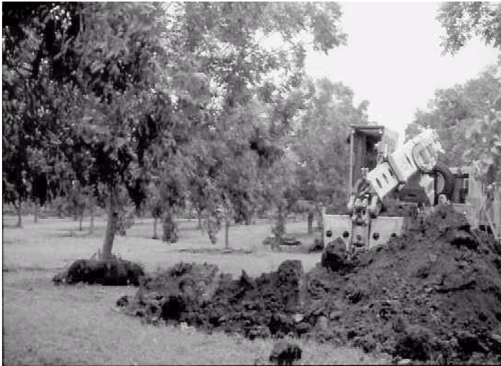
(Drowned cattle being buried in flooded orchard near Luling, Texas, Oct. '98)

Service, and the Texas Department of Transportation. Myriads of animal disaster issues were encountered such as identification and housing of stray livestock, capture and transportation of the same, as well as coordinating the disposal of the many large animal carcasses. Lower Colorado River Authority (LCRA - a pseudo-governmental agency) and local emergency response personnel played integral roles in coordinating the general debris removal and disposal process. Animal carcasses were generally considered as debris during the process, and were buried (where found if possible) or burned in air curtain incinerators along with other refuse. The laborious clean up process for animal carcasses took place over a two-week period in the 20 counties declared disaster areas (Wilson, TAHC internal report, 1998, & Ronsonette, 2001).