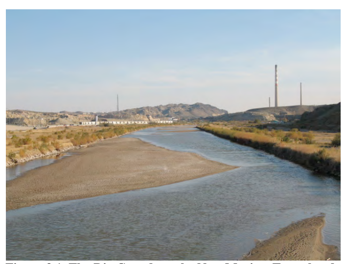
Figure 3.1. The Rio Grande at the New Mexico-Texas border.

River Compact of 1948;<sup>25</sup> the Rectification of the Rio Grande Convention between the United States and Mexico of 1933;<sup>26</sup> the Equitable Distribution of the Waters of the Rio Grande between the United States and Mexico of 1906;<sup>27</sup> and the 1944 Treaty (Moore, et al. 2002).