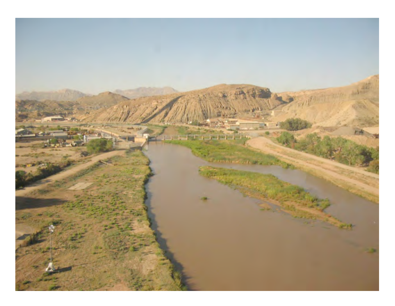
Figure 2.5. The Rio Grande at El Paso, Texas.

and groundwater separately throughout the state for waters within Texas' borders, and state agencies aid in administering theses laws. United States federal law establishes standards for water quality and pollution control, protects water flows for endangered species, and protects historically or culturally significant portions of rivers. Finally, an international treaty oversees the disposition of the Rio Grande, a cultural icon for both Texas and Mexico, and the largest source of water in the region. This treaty, and its history are discussed in the following section.