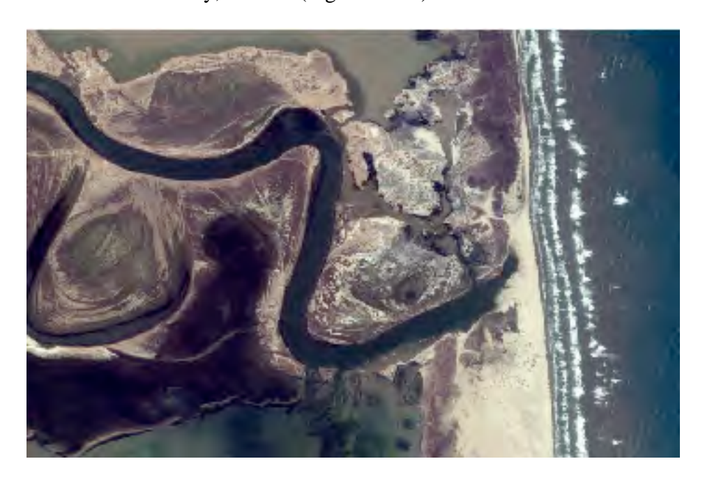
Figure 4.1. Satellite imagery of the Rio Grande at the Gulf of Mexico.

expected to diminish rapidly in the second half of the 21<sup>st</sup> century (Eaton and Hurlbut 1992). The urgency was epitomized when the Rio Grande stopped flowing into the Gulf of Mexico for the first time in recorded history, in 2001 (Ingram 2004).