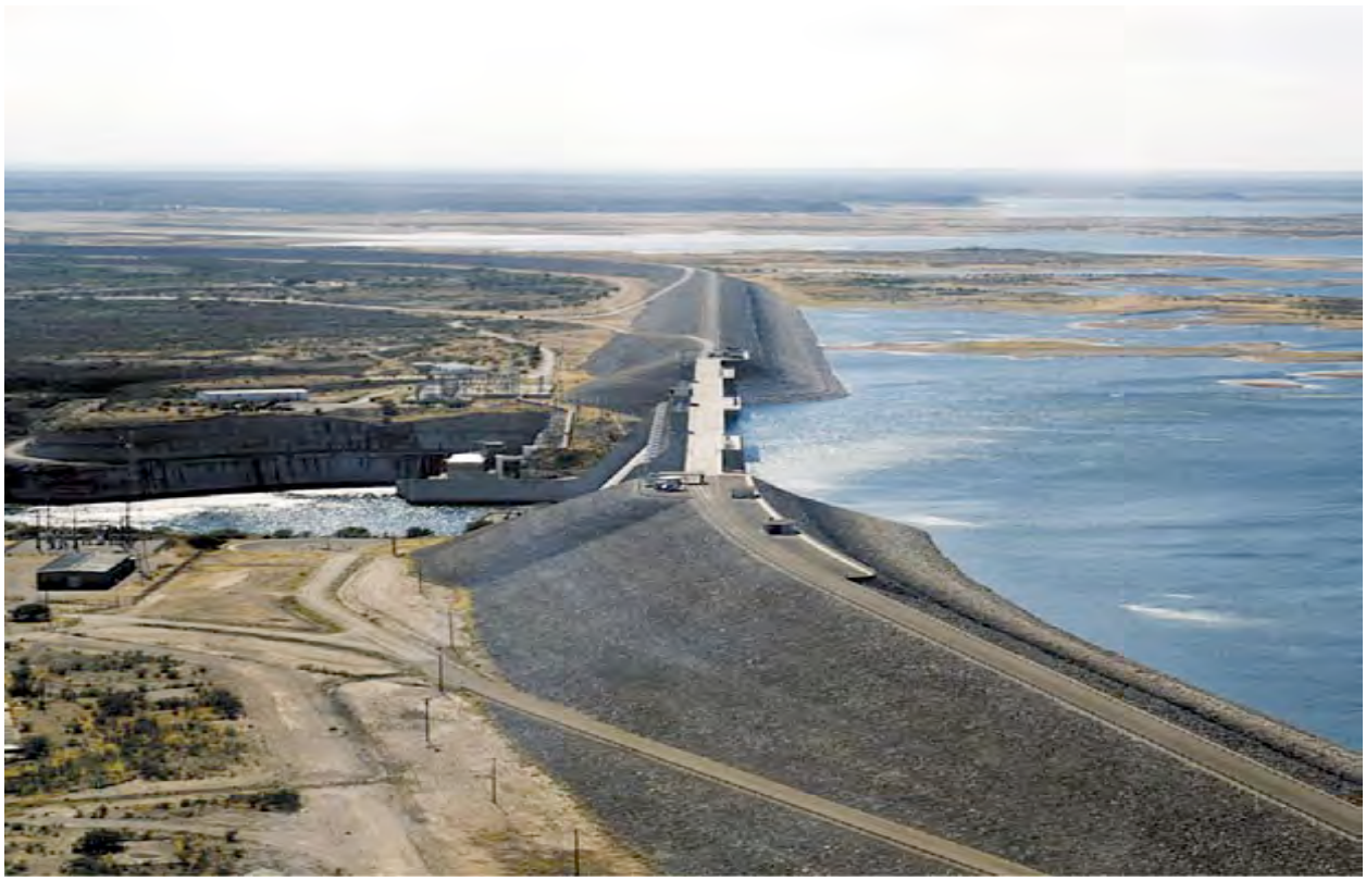
Figure 2.3. Lake Amistad Reservoir at the Rio Grande River (near Del Rio, Texas).

Paso County with 96 percent of the region's residents, and the largest economic sectors include agriculture, agribusiness, and manufacturing (Texas Water Development Board 2009). Moving eastward to the mid-basin region (also known as the Plateau region), the population diminishes as land use changes to support vegetation for grazing and livestock (Texas Water Development Board 2009). The lower basin regions, known as the Rio Grande and Coastal Bend regions include five cities (Brownsville, McAllen, Laredo, Harlingen, and Eagle Pass) with expected high increases in growth (Texas State Data Center 2009). This area relies heavily on agriculture, trade, services and manufacturing for economic stability (Texas Water Development Board 2009).