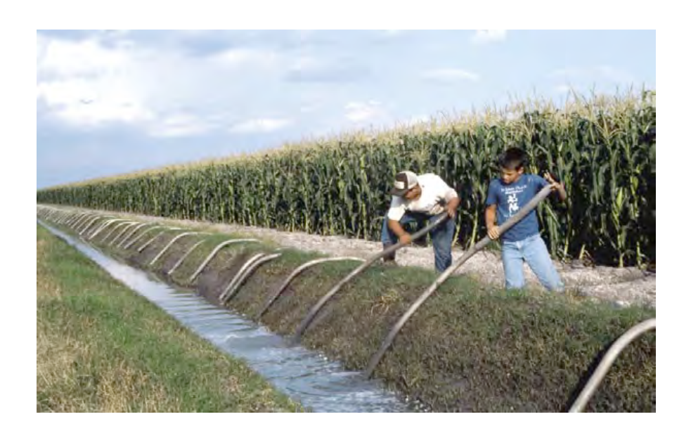
Figure 3.2. Irrigation channel.

The exclusion of groundwater from the 1944 Treaty has already created serious tensions between the United States and Mexico, and continues to be a major issue. Groundwater is a principal source of fresh water for many communities that straddle the international border and in the Rio Grande Basin. Many are either wholly or mostly dependent on groundwater as their source of fresh water for basic human needs (Mumme 2005a). Although it is a vital resource, the 1944 Treaty did not address groundwater until Minute 242<sup>30</sup> was agreed to in 1973. Water from the Upper Colorado River Basin used by American farmers for irrigation became highly saline after the water percolated through the salty Western soils and back into the Colorado River