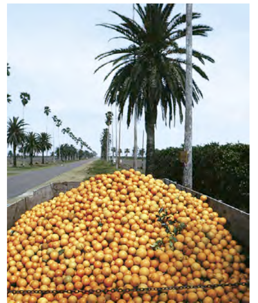
Figure 2.6. Rio Grande Valley citrus crop.

Liverman, et al. (1999) provide a comprehensive history of U.S. industrial interests and political policies that have affected the border region, beginning with nineteenth-century mining interests that encouraged development and settlement of the region, and changes to the environment. Prohibition in the U.S. resulted in a boom in tourism for Mexico in the 1920s and 30s, and increased urban development resulted to accommodate this new industry. Throughout the twentieth century, heavily subsidized irrigation in both countries led to further development of irrigated farmland; planting high-value, high-water crops became a popular convention. Hydroelectric dams and multiple water projects during the New Deal era brought still more development and severe, permanent changes to the riparian habitat of the region.