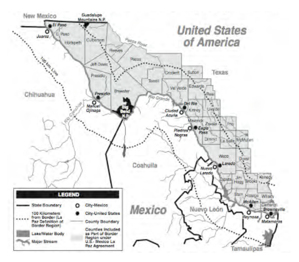
Figure 1.1. Texas region of the U.S.-Mexico border.

Texas faces significant water supply issues both within the state and along its international border.<sup>3</sup> The U.S. Federal Government defines the U.S.-Mexico border area as 100 kilometers from the political boundary of the United States and the United Mexican States (Environmental Protection Agency 2006). This area is demarcated by the dotted line on either side of the Rio Grande in figure 1.1, below.<sup>4</sup> The border area includes 32 counties in Texas, 14 of which are entirely within the federal definition of the U.S.-Mexico border area. Binational