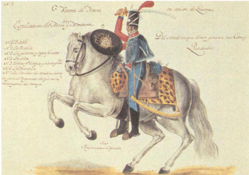
Figure 2. Texas Hussars in battle action. [Right side]: On the state in which the presidio companies should be placed.