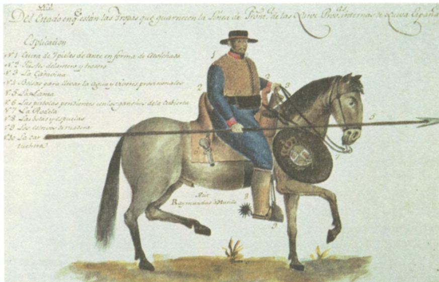
Figure 1. On the state of the troops that garrison the frontier line of the nine interior provinces of New Spain