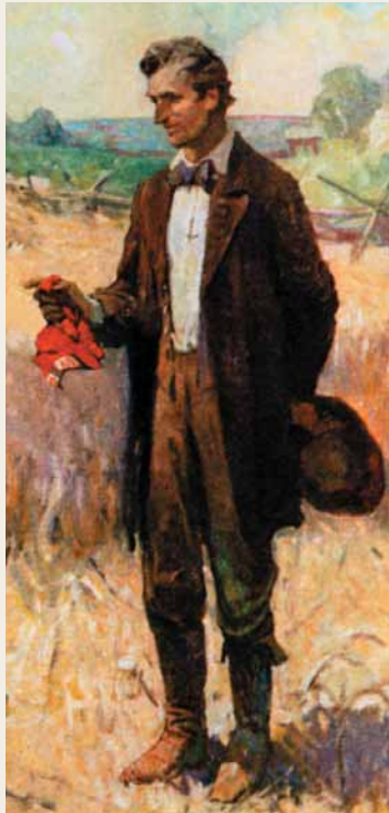
WILMINGTON SAVINGS FUND SOCIETY, FSB, WILMINGTON, DELAWARE