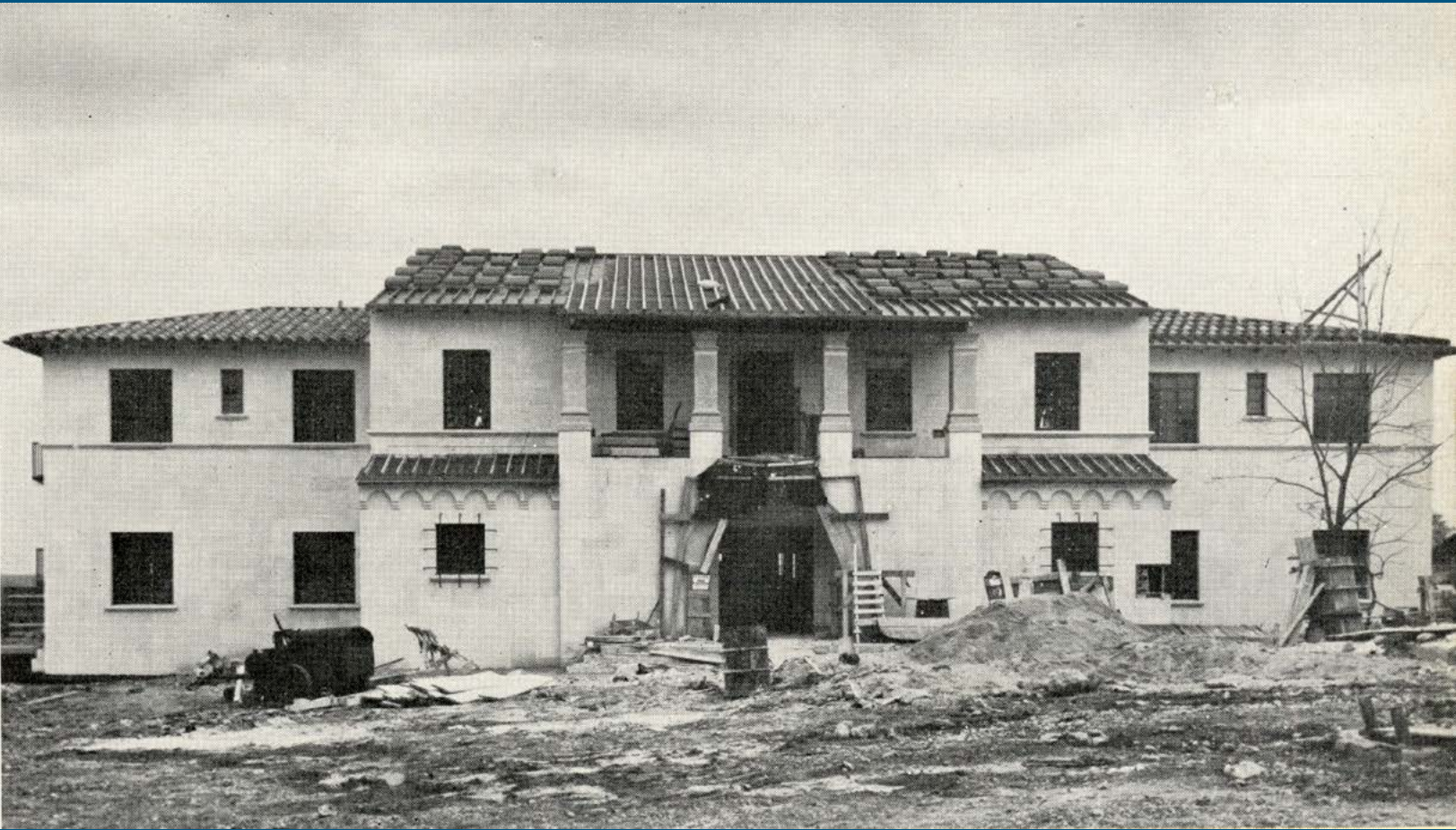
Commons Hall under construction, from the 1951 Pedagog