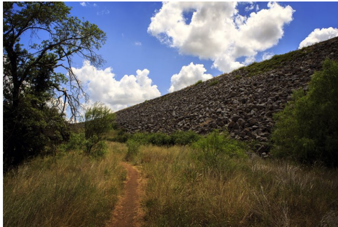
Figure 6. Purgatory Creek Dam, San Marcos, Texas

Purgatory Creek Dam would be eligible under criterion A of the National Register as it is significant within the larger regional history of San Marcos and the watershed area. It is not unique in its form as a large earthen dam, however, and therefore might not be considered eligible under criterion C. The location and design of the Purgatory Creek Dam are original and have not been changed or disturbed. The materials are original, and the workmanship is visible when compared to other control dams built by the Upper San Marcos Watershed. However, the dam does not generate a historic feeling because it dates to 1989 and does not meet the Criterion Consideration G.