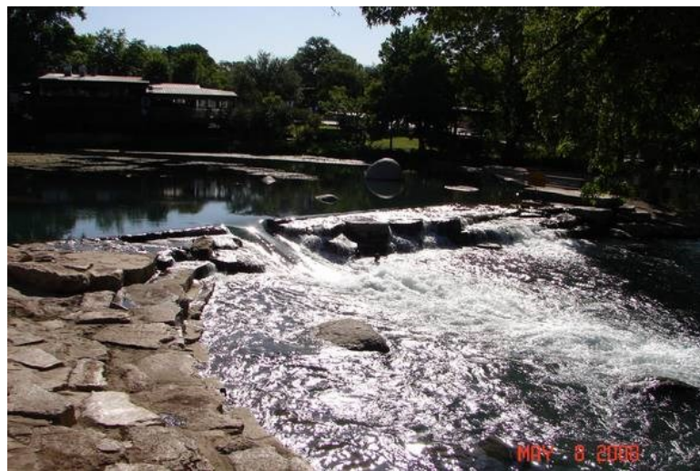
Figure 5. Rio Vista Dam San Marcos, Texas

These dams are often owned or purchased by local or state government bodies and could be designed by professional engineers or funded and maintained by a government entity due to their possible strategic location or function. Often, the management of industrial-civic dams falls to a local or state government in order to keep a strategic dam functioning.