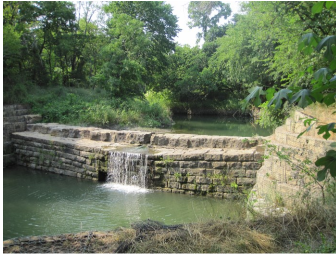
Figure 4. Old Stone Dam, Allen, Texas

downstream. 157 The location and design of the Old Stone Dam are original and have not been harmed or altered. The setting remains rural and has not changed since the resource's period of significance. The materials and workmanship remain original and intact. The large block stones of the dam, in conjunction with the structure's location, enhance a strong historical feeling.