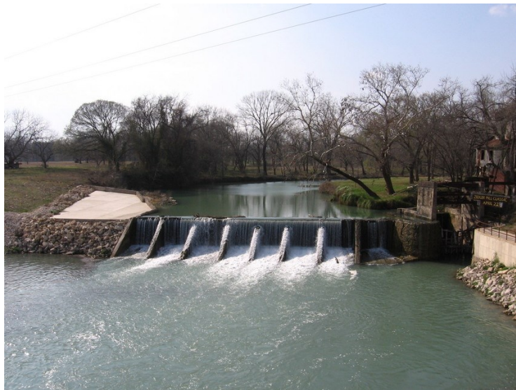
Figure 7. Zedler's Mill Dam, Luling, Texas

Some industrial-civic dams possess a form derived from structural rather than massive designs. Currently, the TCEQ has identified thirty-three buttress dams under its jurisdiction. As explained earlier, the buttress design requires less material than gravity dams and attains its structural strength by reduces materials with vertical buttresses. The form can be found in several industrial mill dams around the state. It is unknown if buttress dams serve other functions than industrial-civic.