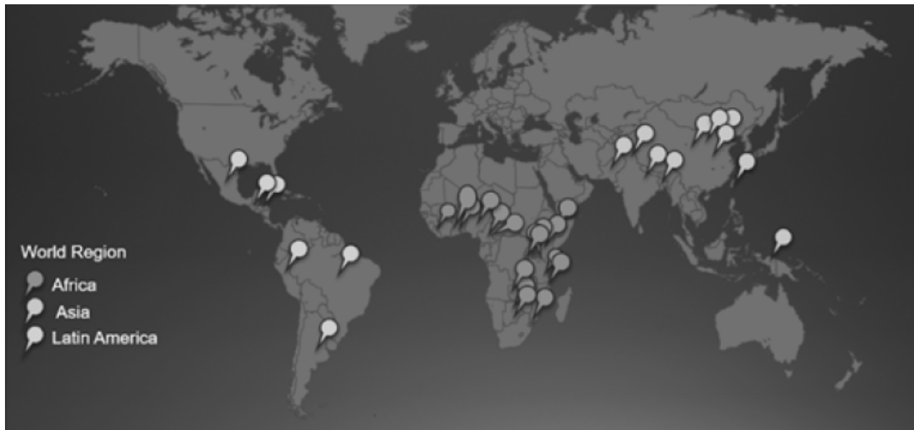
Figure 2. Location of studies of mobile health technologies to improve preventive health outcomes in developing countries, by region.

Table 1 summarizes the following details of each article analyzed: study design, sample size, technological intervention, health outcome, barriers identified, and world region.