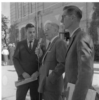
Unidentified image from 1960

ONE OF THE most significant challenges facing the University Archives is how to provide access to the hundreds of thousands of images in the photographic negative collection. Many boxes of campus-related negatives dating from the 1960s through the 1990s were transferred to the University Archives about eight years ago, but the images are largely inaccessible because of the format and lack of descriptive information about the images. However, thanks to the work of the library's Digital and Web Services unit, the university's photographic history is gradually becoming more visible.