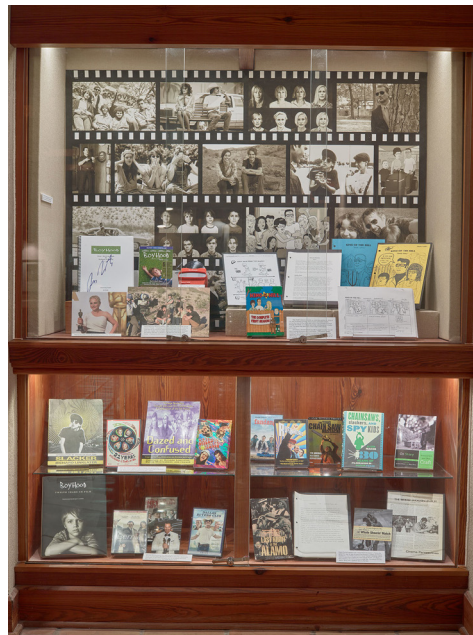
Places in the Heart exhibit now on display

Several major film archives at the Wittliff Collections are part of the exhibit, including the recently donated collection of Academy Award-winning writer/director Robert Benton ( Places in the Heart , Bonnie and Clyde ). The