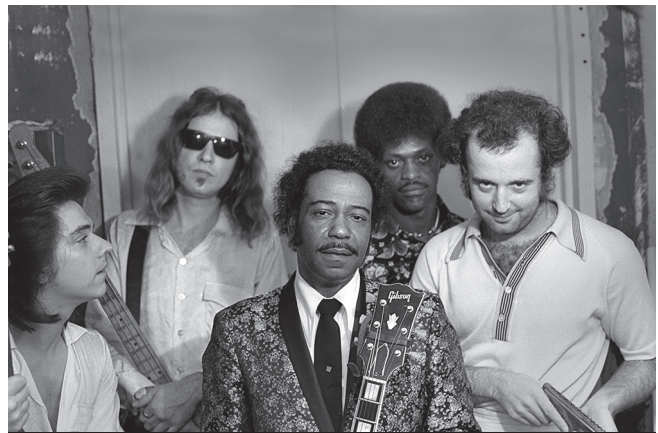
Bluesman Eddie Taylor with The Fabulous Thunderbirds at Antone's.