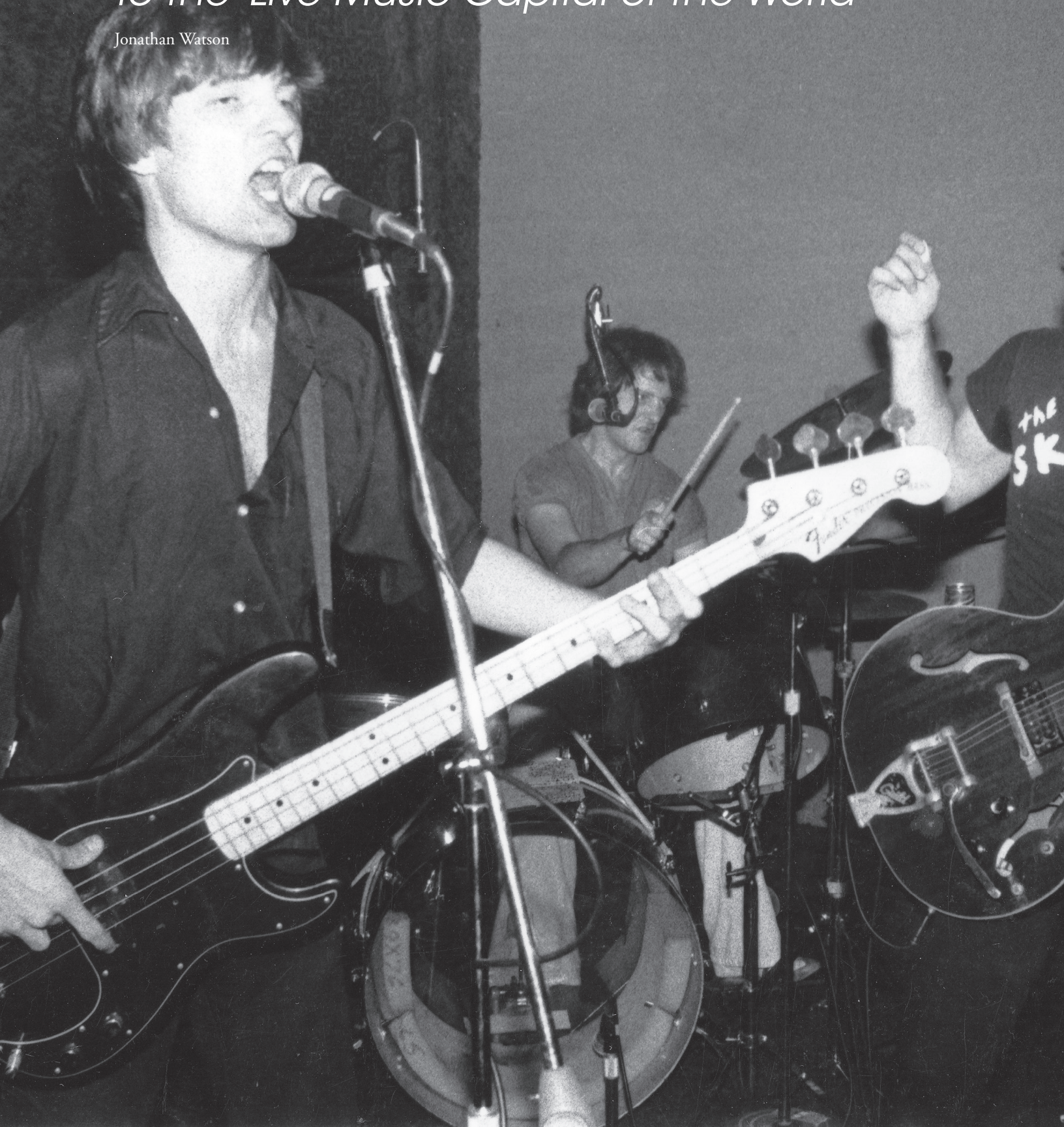
The Skunks at Raul's in 1979.