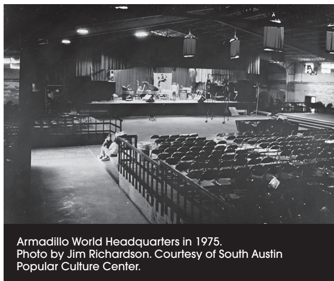
Armadillo World Headquarters in 1975.