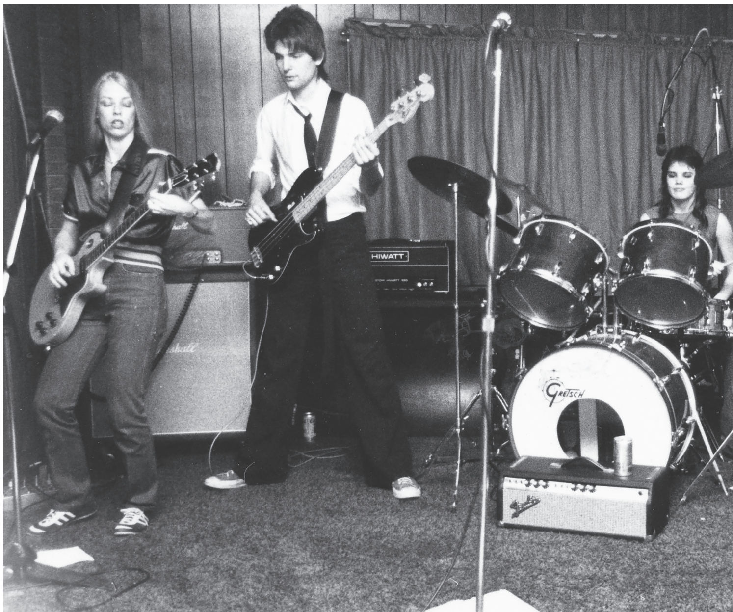
The Violators' first performance at Raul's in February 1978.

closed. And that was really cool. It was really over my head. I was just a young teeny bopper. . . . It was just really neat, because it was a cultural experience. You know, it was hippies. 32