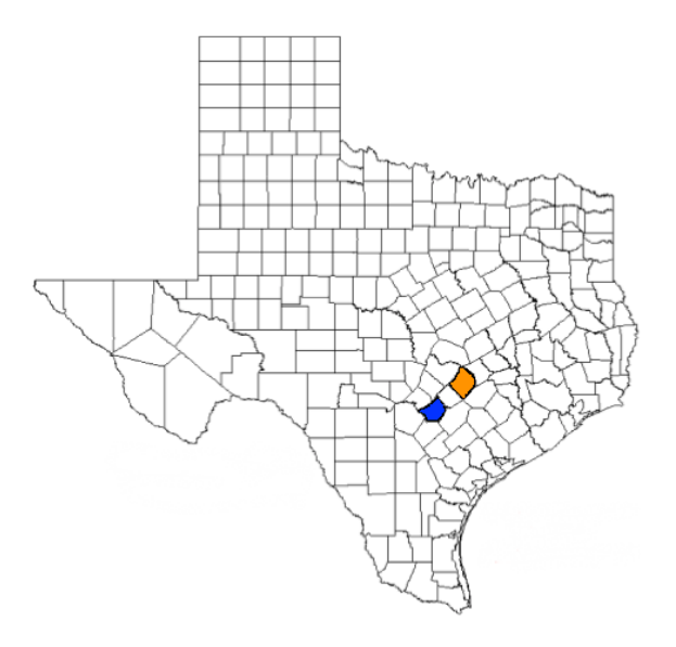
Figure 1. Map of Texas counties showing locations of study sites. Guadalupe County is highlighted in blue and Bastrop County in orange.

I conducted my study at a site in Guadalupe County in the Blackland Prairie ecoregion and another site in Bastrop County in the Post Oak Savannah ecoregion. Both sites had pre-drought monitoring of herpetofaunal diversity, abundance, and measurements of all specimens. Pre-drought data were collected during 2004 at the end of a period with above average precipitation. Post-drought data were gathered during 2009 at the end of a severe drought that began in 2007 (Neilsen-Gammon and McRoberts 2009).