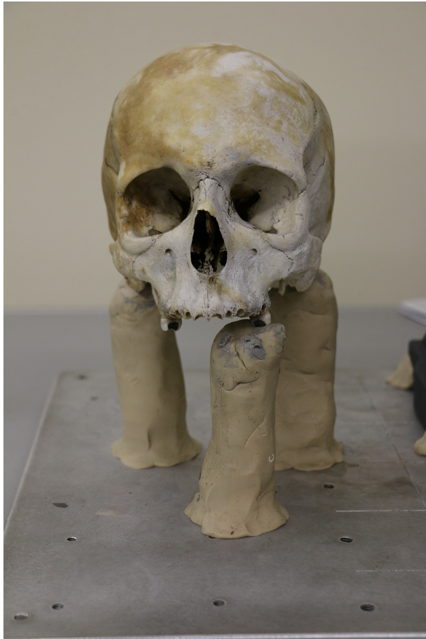
FIGURE 1: Cranium stabilized on clay pillars, prepared for digitizing.