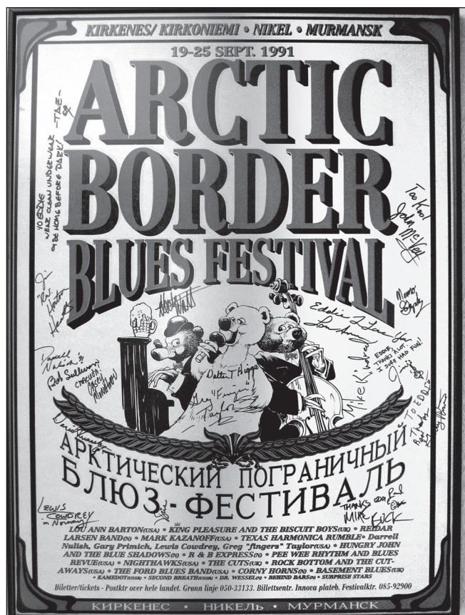
Poster for Arctic Border Blues Festival.