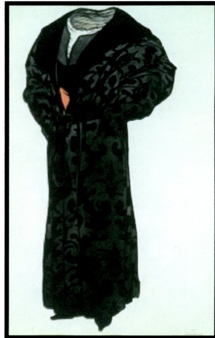
Fig. 1. Costume design for Antonio from The Merchant of Venice . (TL1999.108.1)*