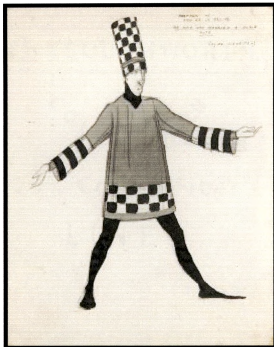
Fig. 2. Costume design for the Footman to Madame de la Bruine from The Man Who Married a Dumb Wife . (TL1999.105)*