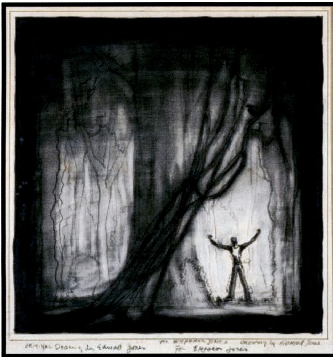
Fig. 6. Scene design from The Emperor Jones . (TL1999.37)*

While Jones is most recognized for his work as a designer, it should be noted that he was an accomplished director as well. Jones directed and designed several plays after