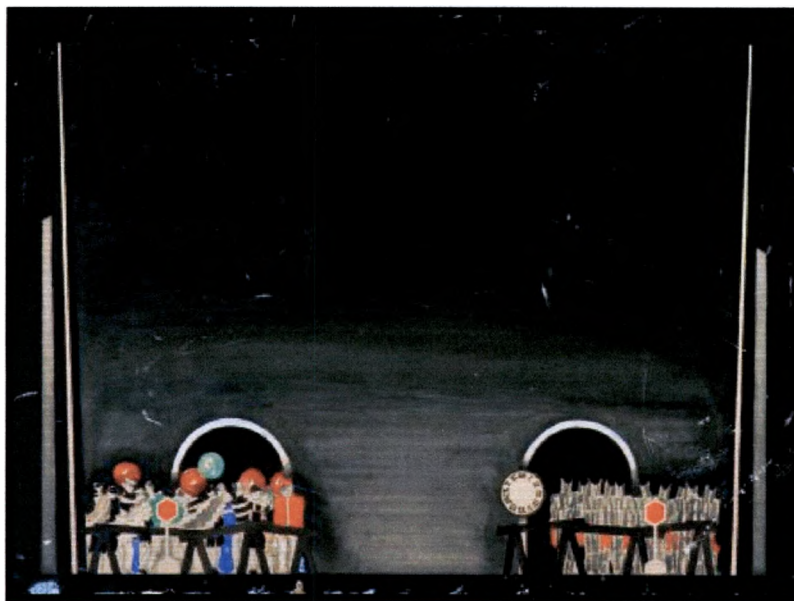
Fig. 12. Scene design for “Subway” from Skyscrapers . (TL1999.116.4)*