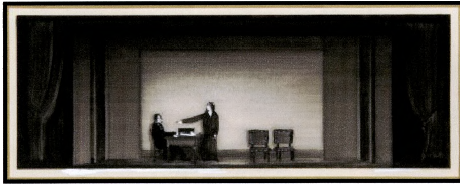
Fig. 5. Scene design from Redemption . (TL1999.110.1)*

While Jones is most recognized for his work as a designer, it should be noted that he was an accomplished director as well. Jones directed and designed several plays after