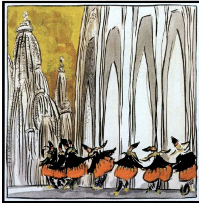
Fig. 4. Scene design from Till Eulenspiegel . (TL1999.119.1)*