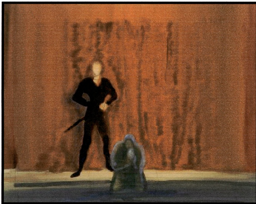
Fig. 9. Scene design from Hamlet . (TL1999.102.2)*