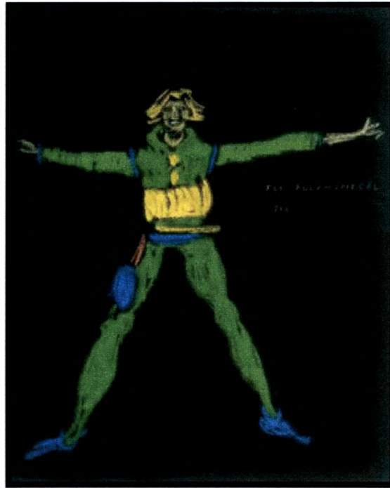
Fig. 3. Costume design for Till from Till Eulenspiegel . (TL1999.118)*

(TL1999.119.1-2) designs from this production. (Note: Figure 3 is a chalk and graphite on paper drawing, producing the blurred appearance seen in the reprint.)