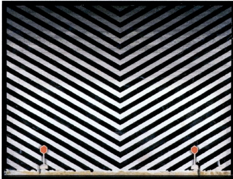
Fig. 11. Scene design for “Construction Site” from Skyscrapers . (TL1999.116.3)*

flanked by two stop signs to help establish a modern and bustling industrialized city. A distorted skyscraper (see fig. 10) looms as a symbol of the brutal toil of a futuristic style society, depicting the dynamics of Americans at work and at play. His stark “Construction Site” (see fig. 11) stands as an ominous black, white and red skeleton. The