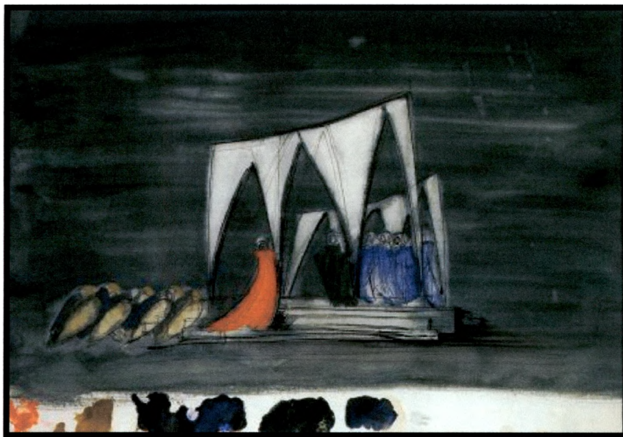
Fig. 8. Scene design from Macbeth . (TL1999.104.2)*