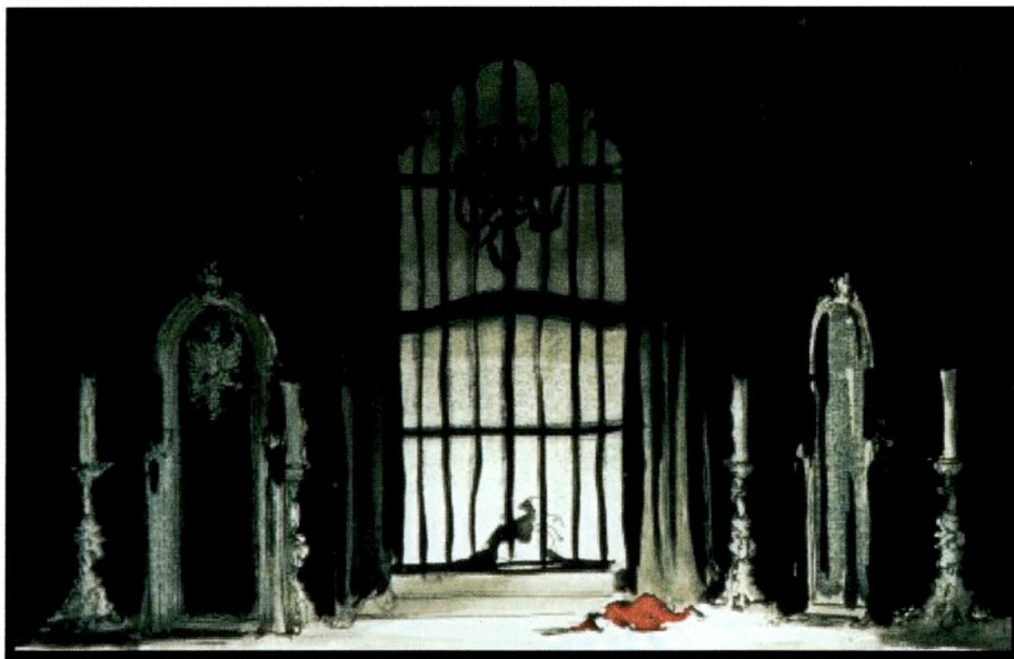
Fig. 7. Scene design for the “Hall of the Mirrors” from The Birthday of the Infanta . (TL1999.35)*

Representing an interior corridor in the mansion, a tall iron gate is placed center stage,