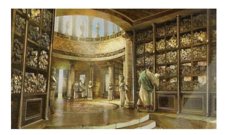
The Great Library of Alexandria: Information and the Scroll

After looking at these modern examples, we would now go back to the present day great library of Alexandria in modern day Egypt. Do traces of the past remain? What are the library's present objectives? How did this library function in the ancient world and what was its purpose with regards to empire and the state? Are there parallels for significance today?