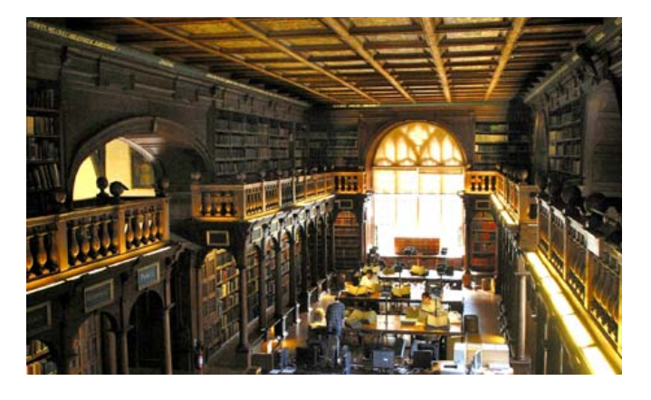
Oxford University's Bodleian Library

From here we would travel to the great libraries of Europe: Oxford, The British Library and the Bibliotheque Nationale in Paris. How did these great university and national libraries begin? What are some of their hidden treasures? Who were the high and low-born patrons? Apparently, Marx spent much of his time in London in the British Library and what about all of the scholars and students around Oxford? What roles did the original libraries play in Europe and how do they serve the patrons, students and general public today?