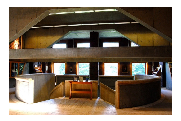
Architect Louis Kahn's Spiritual Masterpiece, Exeter Library

Libraries have always been places of learning, reflection and inspiration. What is the history of 'shhhh!' and where does it come from? Are libraries still quiet places? Let's look at libraries, quiet and noisy, from magisterial monastic origins to more current masterpieces of reflection and inspiration ranging from New York Public's great reading rooms to Louis Kahn's modernist library masterworks at Yale and Exeter in the quest for spirit in library design.