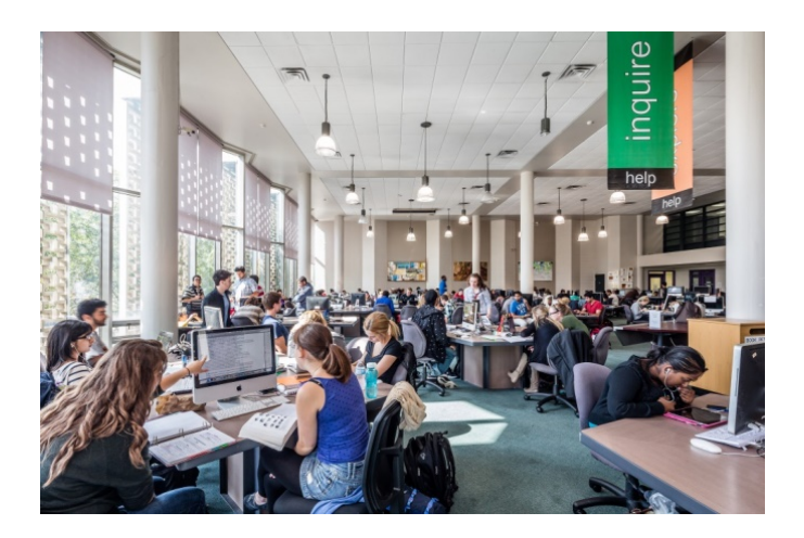
Mills Memorial Library Learning Commons, McMaster University

The current buzzword in libraries is 'the learning commons'. Like it or not, books are being shipped out and technology en masse is being brought in. What does this current technological sea change for libraries herald? Does it signal the end of libraries? Has the internet taken over the role of the library? Will people now stop reading paper-based media and have the techno barbarians successfully stormed previous monastic gates? This episode will explore our new millennia redefinition of libraries.