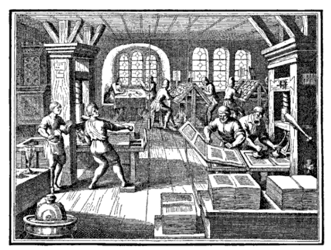
The Gutenberg Press and Moveable Type: 1439

What would a history and introduction to the world of libraries be without a deferential bow to the history of the book? This episode will look at the first books beginning with Gutenberg (Incunabula, 1439) and moving to the mass production of print in the 19<sup>th</sup> and 20<sup>th</sup> century to our era of e-books. Is this the end of this love affair? The second part of this episode will examine complex possibilities and challenges of e-books, Kindle, iPad, Audible etc.