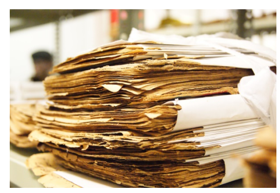
Ancient Manuscripts at Sankore Madrasah, Timbuktu, Mali

While our libraries in North America and Europe are well-known with longstanding histories, there are 'other' libraries and library traditions in Africa, Asia and South America. Except for disciplinary experts, these libraries and library systems are mostly unknown to the western world. This episode will explore these dark continents of libraries and treasures nodding to the Gates and other international foundations amazing work with libraries and information technologies in developing nations.