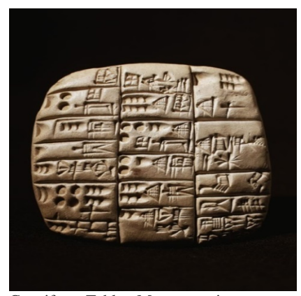
Cuneiform Tablet, Mesopotamia

From here, we will take a deeper dive into the vast realm of the organization of knowledge and history of the catalog. This episode overviews these classificatory schema and their history from the first tablet catalogs to the digitized Mesopotamian tablet library in Princeton looking at the codification of the catalog of human knowledge with Dewey, the Library of Congress, Ranganathan in India, and other heterodox organizational systems, such as Aby Warburg's unique organization of the Courtauld Art Institute, London.