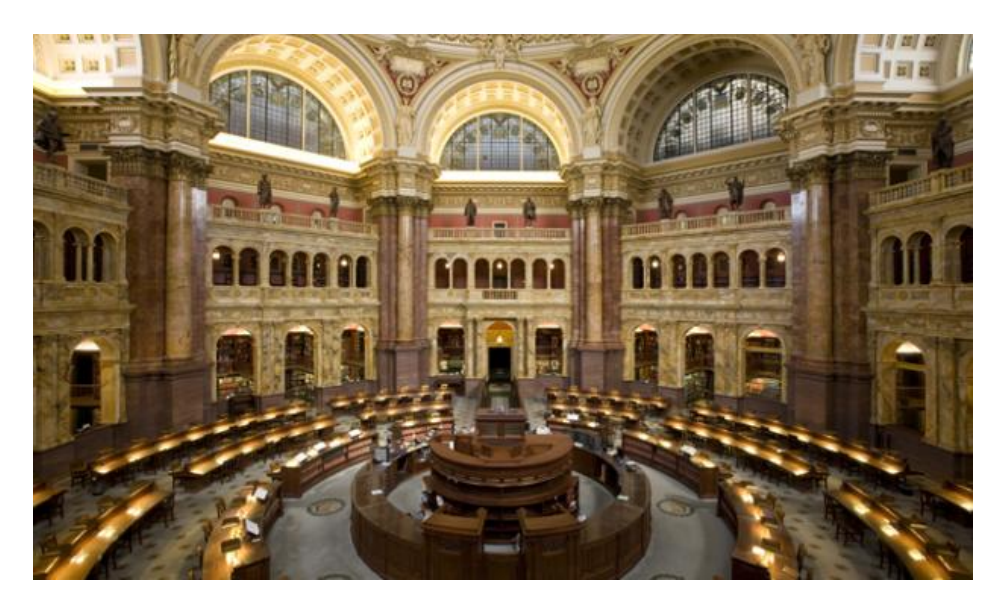
US Library of Congress, Washington D.C. Great Reading Room

Beginning locally, the series would then tour some of the great libraries in the US: the <u>Library of Congress</u>, Harvard's <u>Widener</u>, the <u>New York Public</u> and Andrew Carnegie's decision to fund libraries for the public good in the 19<sup>th</sup> century. What were each of these libraries' purposes? How did they develop and what are a few of their treasures?