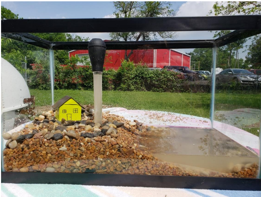
Figure 3: Aquifer in a Fish tank: displays the effects of groundwater pumping

In the lesson, each individual pumped water using a turkey baster from the higher surface area. The higher surface area was dry so when the turkey baster filled up with water, it displayed that water was underneath the surface even though they could not visually see this water. It was at this point, that an individual exclaimed, “Oh this is groundwater, water from the ground”. At this moment, the individual understood that groundwater came from underneath the surface and not a giant hole in the ground filled with water. This led to the conversation to how water is a finite resource and how individuals can conserve water to protect our natural resource.