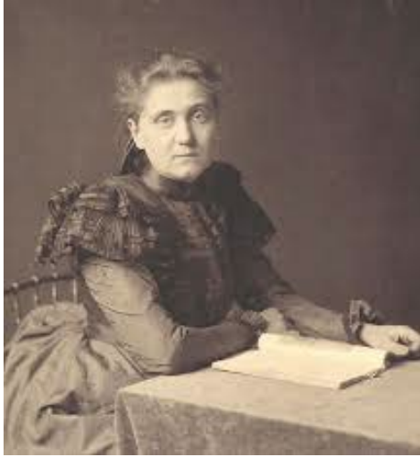
Democracy and Social Ethics Jane Addams