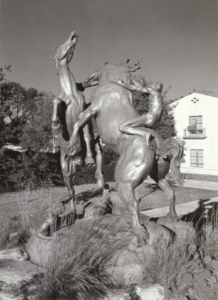
Statue with original base, constructed 1950s, photograph circa 1962