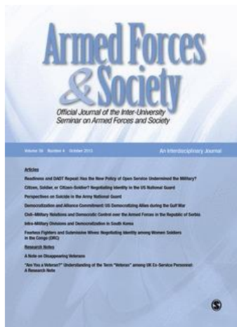
Figure 1: Picture found at Armed Forces & Society website

Armed Forces & Society (AFS) is a quarterly scholarly journal publishing articles on military institutions, civil-military relations, arms control and peacemaking, and conflict management. The journal is international in scope with a focus on historical, comparative, and interdisciplinary discourse. The editors and contributors include political scientists, sociologists, historians, psychologists, scholars, and economists, as well as specialists in military organization and strategy, arms control, and peacekeeping.