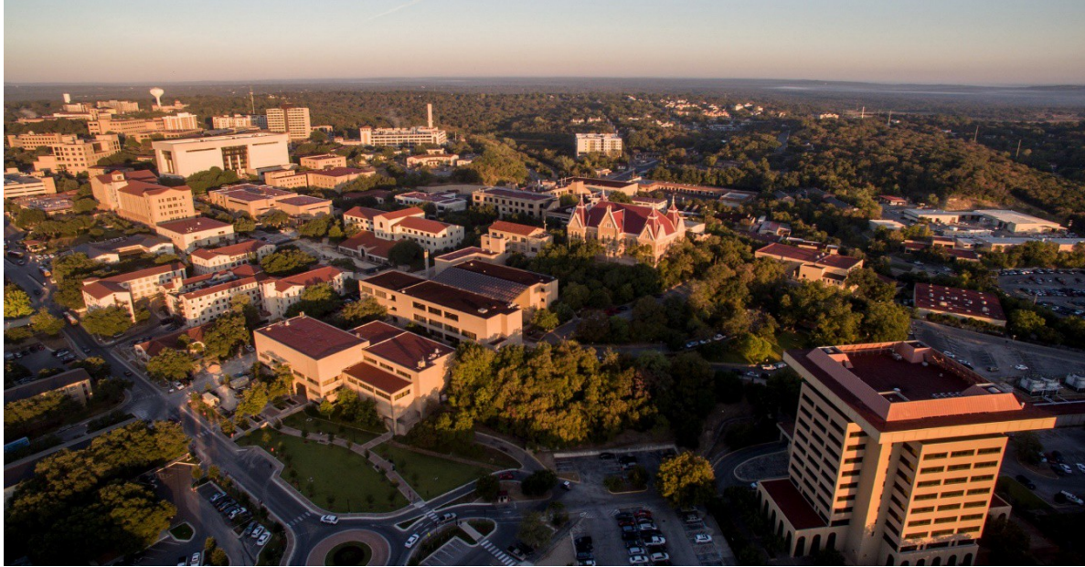
Figure 5. Texas State University Campus. Retrieved from the official TXST Twitter.