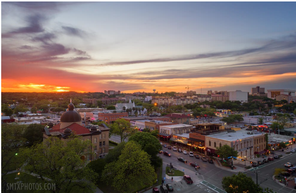
Figure 4. Downtown San Marcos.