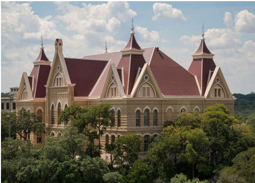
Figure 6. Old Main, Texas State University Campus.