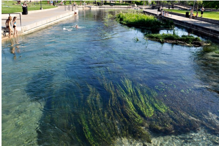
Figure 3. San Marcos River. Barer, D. (n.d.).

The San Marcos River also ranked second in the United States by USA Today for the best river tubing (Best River for Tubing Winners, 2016). Overall, San Marcos, Texas is known for its booming population and outdoor activities.