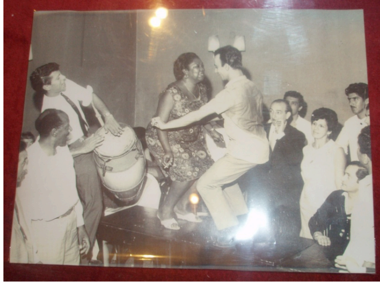
Figure 1. Example of candombe in a Shimmy Club. This is a picture of candombe in a Shimmy Club in the Casa Suiza (Swiss House). The original photographer is unknown, but the picture was taken around 1960.