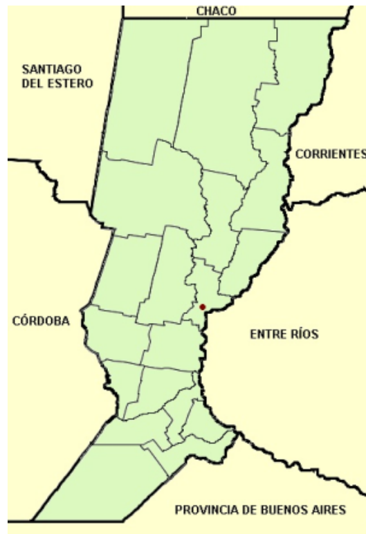
Figure 10. Map of Santa Fé Province in Argentina. Santa Fé province (in green) is located in eastern Argentina and is surrounded by several Argentine provinces. It is the location of la Casa de la Cultura Indo-Afro-Americana. ( http://www.esacademic.com/dic.nsf/eswiki/964920 )