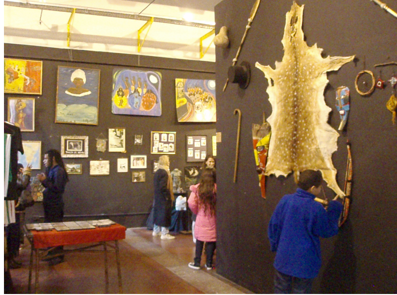
Figure 19. Inside El Movimiento Afro-cultural's Cultural Center. Children talk in the foyer and admire artwork on the interior walls of the cultural center before an event.