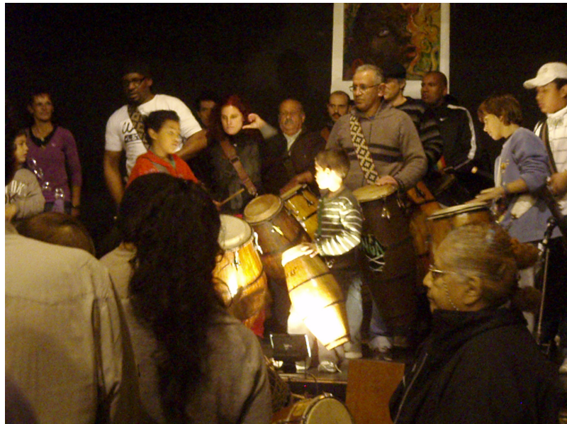
Figure 22. La Escuela Taller de Candombe. El Movimiento Afrocultural has a school-workshop that teaches candombe to men, women, and children. The school performs at the organization's cultural events.