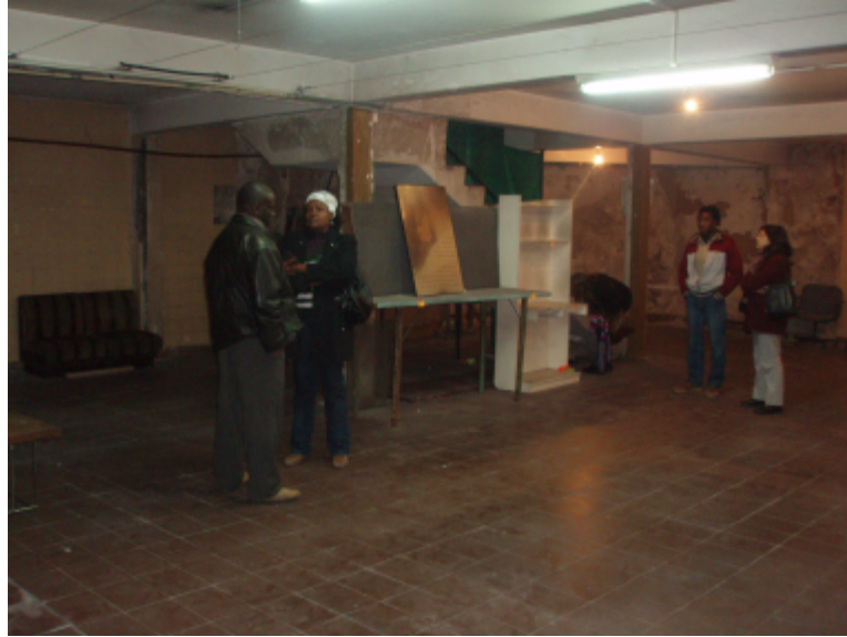
Figure 11. First Black Cultural Space in Buenos Aires. Leaders and members of IARPIDI, ORHA, and la Diáspora Africana survey their new cultural space.