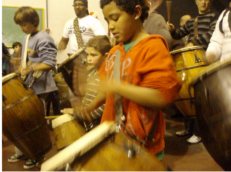
Figure 23. Tocando el Tambor [Playing the Drum]. A boy plays a drum during the opening candombe performance for El Día de la Mujer at the cultural center.