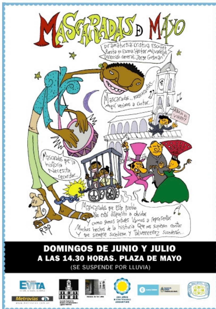
Figure 26. Promotional flyer for “Máscaras de Mayo”. This flyer was used to promote the play that discusses the role of blacks in the revolutionary wars and history of Argentina.