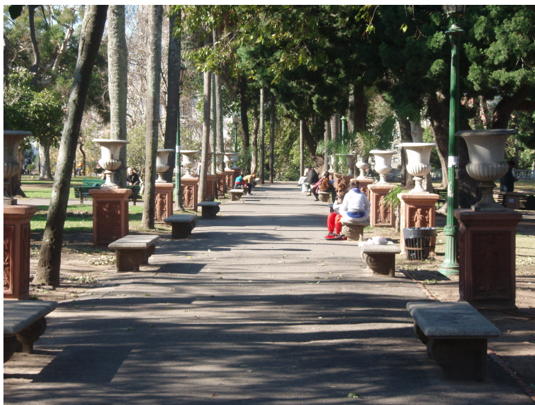
Figure 3. Parque Lezama. This is Parque Lezama in Buenos Aires, which is a former slave trade site in the city.