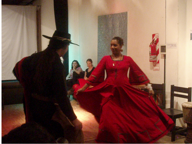
Figure 7. Folkloric Dancing during the Afro Americano Bicentenario Celebrations.