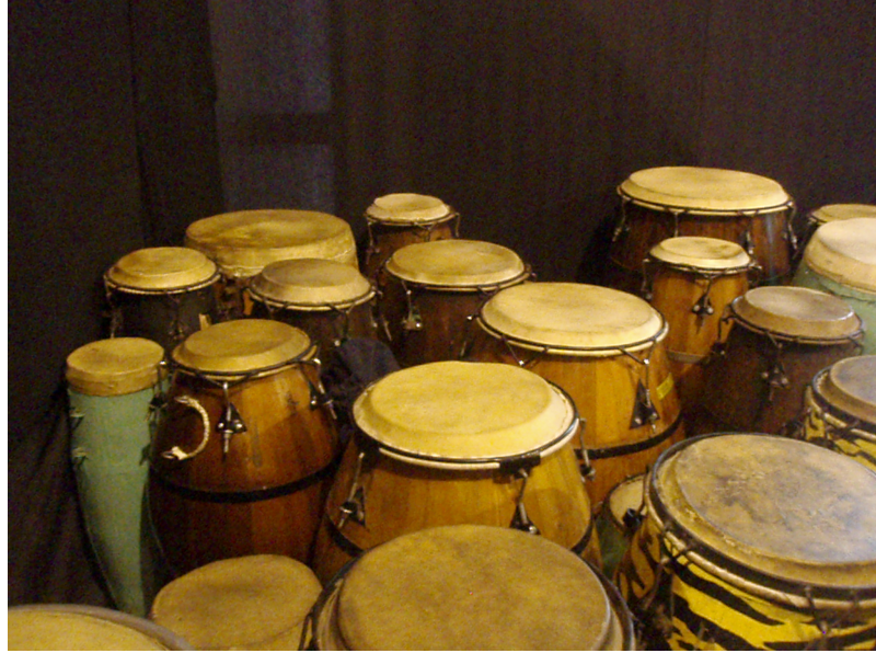
Figure 21. Candombe Drums. Specially made drums used for candombe crowd part of the entryway into the performance room of El Movimiento Afrocultural's cultural center.