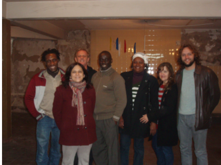
Figure 13. Representatives from Black Organizations. Members of IARPIDI, ORHA, and colleagues in the first Afro cultural space in Buenos Aires.