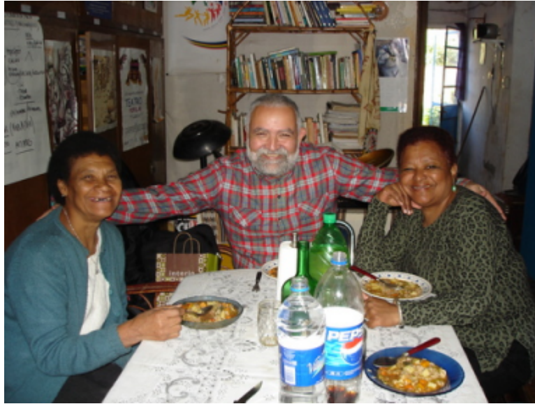
Figure 9. Casa de la Cultura Indo-Afro-Americana. Photograph of members in the first Afro cultural space.