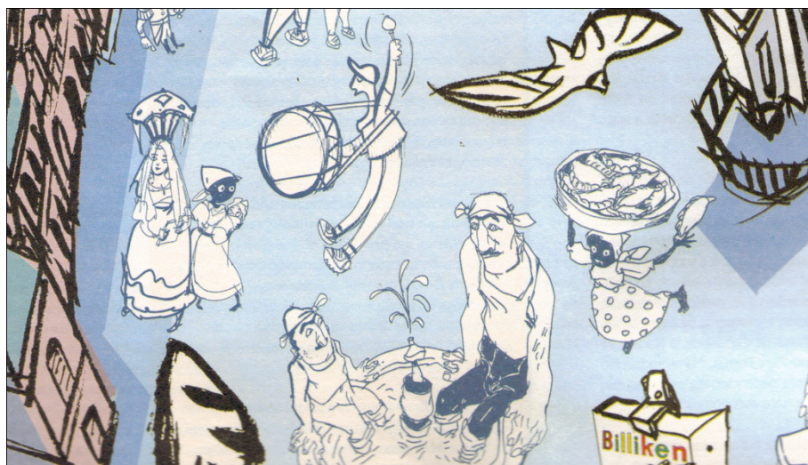
Figure 25. Section of the May 2010 Nuestra Cultura magazine cover. There were only two representations of blacks on the cover. Both of these representations fit stereotypes about blacks, specifically black women.