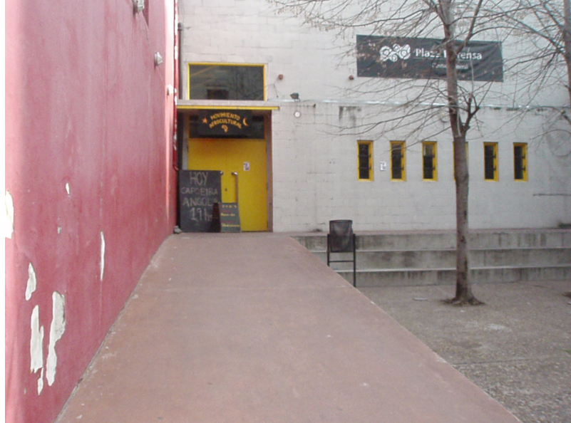
Figure 17. El Movimiento AfroCultural's Cultural Center. The center is located in the San Telmo neighborhood of Buenos Aires.