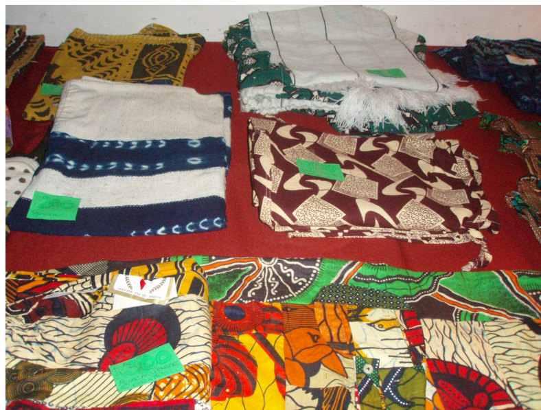
Figure 14. African Fabrics. African fabrics were for sale by some of the black organizations during the Afro Americano Bicentenario Celebrations.