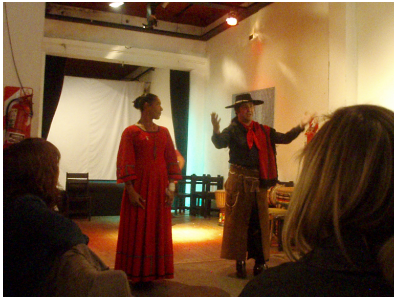
Figure 6. Folkloric Dance of Northern Argentina. Two dancers perform a dance from the Northern provincial area of Argentina. This was performed at the Archibrazo cultural space in Buenos Aires as part of the Afro-Americano Bicentenario celebrations.