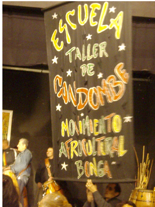
Figure 20. Banner for Escuela Taller de Candombe. A man holds a sign for the candombe school during the opening ceremony for El Día de la Mujer in the cultural center.