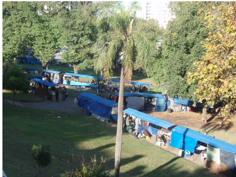
Figure 2. Fería in Parque Lezama. This park in the San Telmo neighborhood of Buenos Aires was one of three slave trade sites in the city. Now vendors sell various goods, such as used clothing, books, and toys in the park.