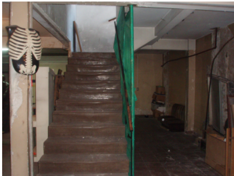
Figure 12. Entrance to the First Black Cultural Space in Buenos Aires. The new black cultural space in Buenos Aires is located in the basement of a building on Avenida San Juan.