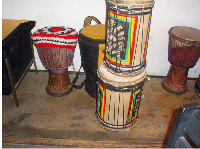
Figure 15. Drums on Display. Percussionists stacked their drums near the walls before their performances during the Afro American Bicentenario Celebration.