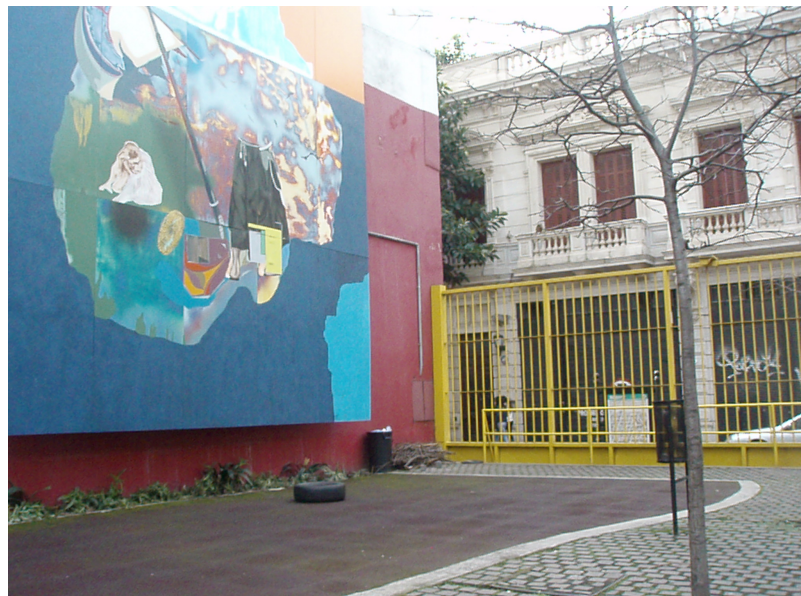
Figure 18. The Courtyard of El Movimiento AfroCultural's Cultural Center.