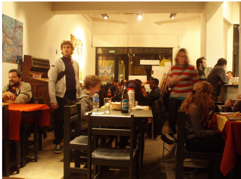
Figure 16. Feria por Haïti. People eat and drink food being sold as part of the Feria por Haïti. This event was sponsored by La Organización de Haitianos Residentes en Argentina, Proyecto 34°S, and other organizations to raise money for those affected by the earthquake that devastated Haiti in 2010.