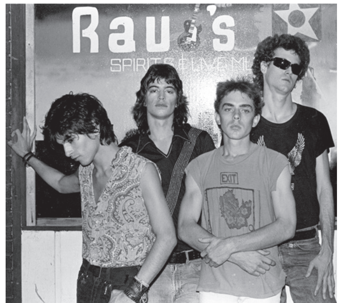
The Next.