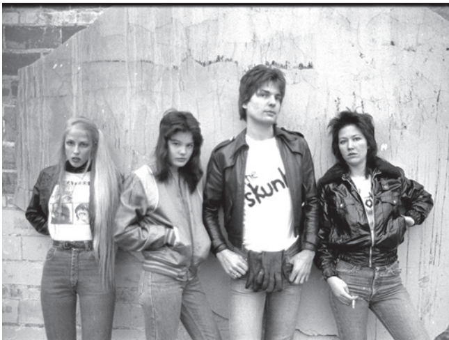
The Violators.