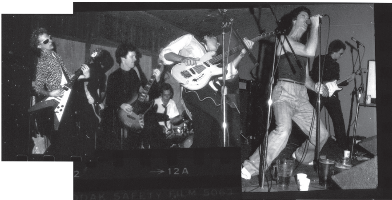
The Bodysnatchers.