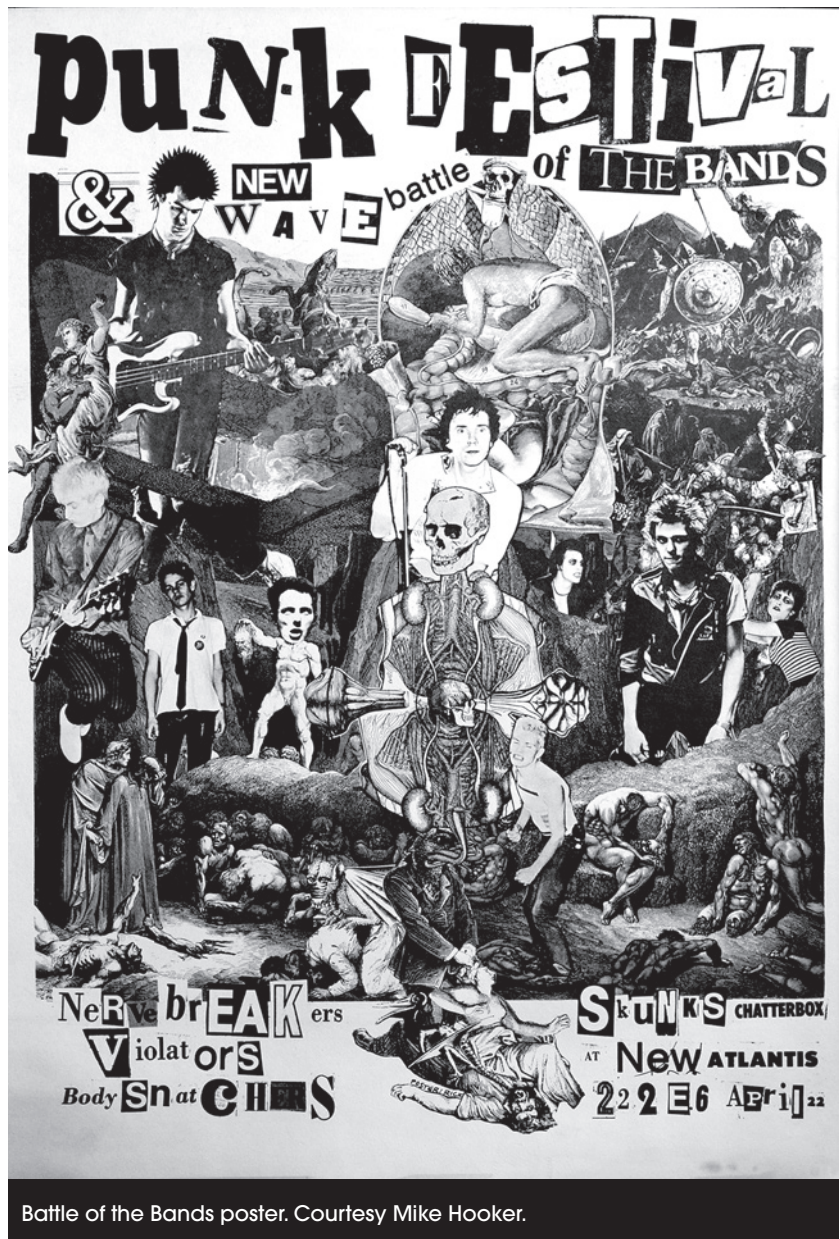
Battle of the Bands poster.