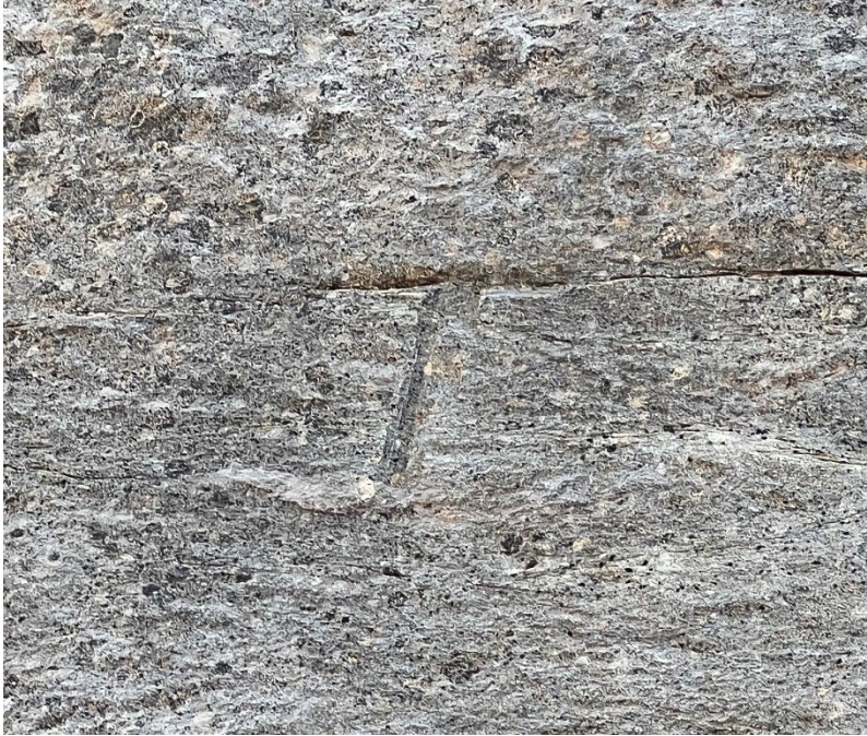
FIGURE 6: “T” carved into bridge abutment

Combining all these aspects into one final product allows for a complete synthesis of the project. It is incredibly important to make history and archaeology accessible, especially when investigating social issues and underrepresented histories, and that is why the final product is online. Because the point of the project is to show – by having the reconstruction – a product of artisanal work and demonstrate why it is important and what can be gleaned from it, the reconstruction needs to be accessible. Providing context through historical research and the artifacts allows for those looking at the reconstruction to understand who made it and why the abutment exists as it does.