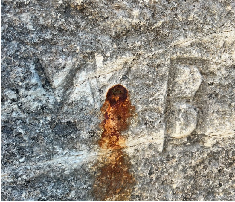
FIGURE 5: “W B” carved into stone on bridge abutment.

Construction of this feature took great artisanship, and most of the people laboring on it were seasoned Chinese immigrant workers. Despite not know which exact men carved their initials onto the blocks of stone, the documented evidence that this portion of the line was built by the Southern Pacific company coming from El Paso – in which 5,000 of the 6,000 workers were Chinese – and the presence of distinctly Chinese artifacts found in the area around the site is indicative of the presence of Chinese labor on this abutment (Voss 2015:12). These Chinese workers were viewed as valuable due to their perceived work ethic and that they could be paid less than their white colleagues (Voss 2015:18). Chinese presence is most obviously felt in the artifact scatter across the land, especially at camp sites. Artifacts such as woks, opium pipes, Chinese coins, and blue-on-white decorative bowls are indicative of a strong cultural existence. However, the location of the sites in West Texas and interaction of the two labor groups along the