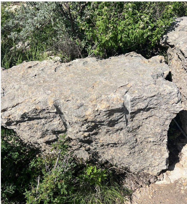
FIGURE 3. Drill holes in the landscape near the bridge abutment.

To construct this section of the line, a great amount of leveling had to be completed, which was extremely difficult given the terrain. Hills were cleared, tunnels were dug, and bridges were built, and almost all this work was completed by hand (Skiles 1996:66). Bridges, including the abutment, were constructed by skilled stonemasons and quarrymen. They took much of the limestone from the surrounding area instead of sourcing it from outside the Pecos area, and this is evidenced by the drill marks left in the rock shelves in the area surrounding the abutment.