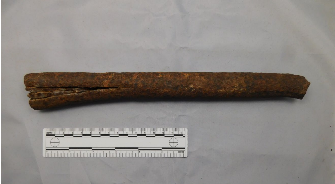
FIGURE 4. Rock wedger from Skiles Historic Railroad Collection

This sourcing would necessitate quarrymen to drill multiple holes in a line and then utilize iron wedges into the holes, and the pressure from these wedges would be enough to break large blocks of the rock loose (Skiles 1996:66).