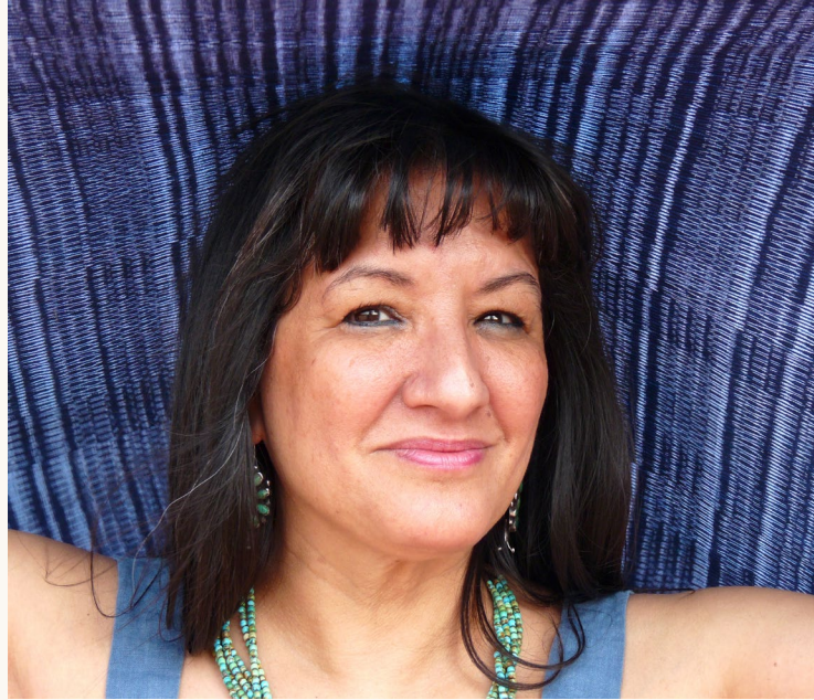
Photo Courtesy of Alan Goldfarb © Sandra Cisneros. Her exhibit will be on display at the Wittliff Collections on the seventh floor of the Alkek Library at Texas State University through July 1, 2017.

Sandra Cisneros: A House of Her Own highlights key artifacts from the Cisneros archive: manuscripts, correspondence, photographs, original drawings, publicity materials, Cisneros's portable typewriter, and her