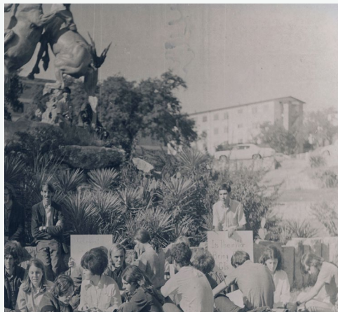
Students protesting the Vietnam War on November 13, 1969

Similar to other American college students in the late 1960s, a group of Bobcats launched a number of nonviolent demonstrations calling for the end of the Vietnam War. Texas State's most famous anti-Vietnam protest took place on the morning of November 13, 1969, when about 50 people gathered between Evans Hall and the Fine Arts Building (now Taylor-Murphy Hall) to stage a peaceful demonstration. The protestors, sitting in grass near the Fighting Stallions statue, wore black cloth strips around their arms and carried signs with phrases such as "It's Their War, Bring Our GI's Home." At around 10:35 a.m., Dean of