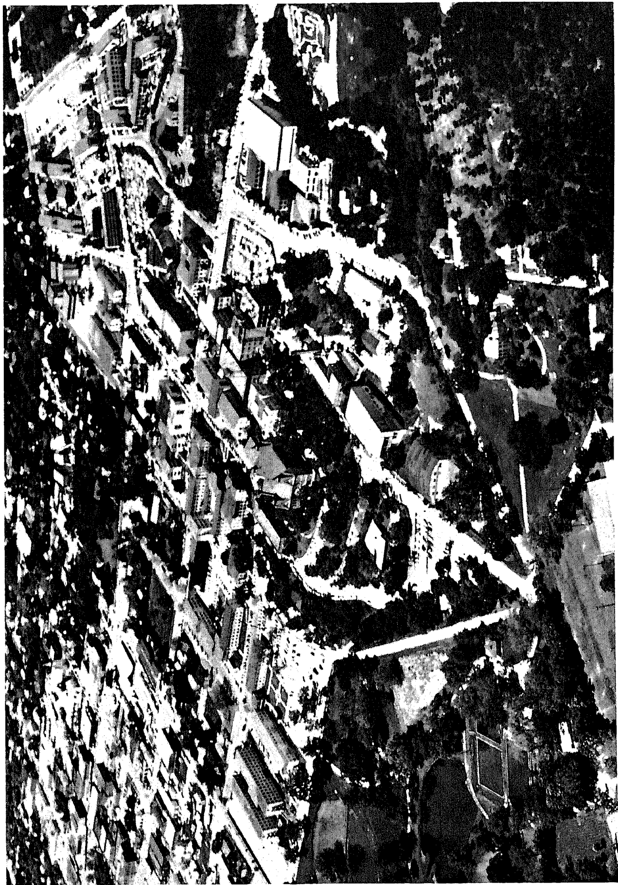
AERIAL PHOTO OF SOUTHWEST TEXAS STATE COLLEGE CAMPUS: SPRING 1966