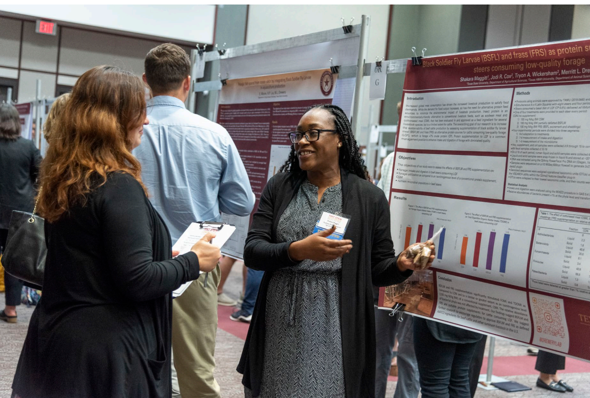
Figure 1. A student poster presenter at the 2023 TXST STEM Conference.

Association between self-identified STEM identity and the number of experiential learning experience semesters completed as an undergraduate student at TXST ( X^2(20) \geq 31.500 , p=0.049 ).