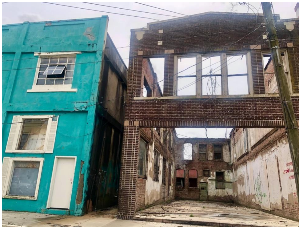
Figure 7 - Buildings located in downtown Clarksdale