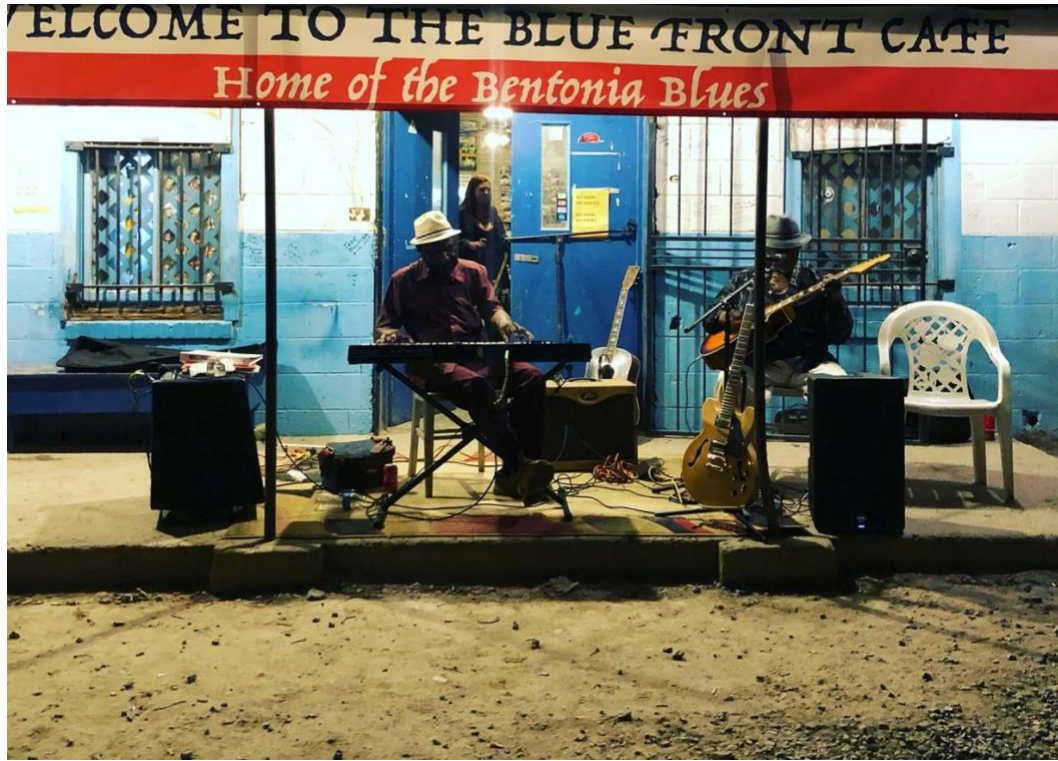
Figure 1 – Blues musicians performing outside the Blue Front Café in Bentonia, Mississippi.

“When this thing hit, it destroyed everything all musicians could even think about. We never saw anything like this coming” – Big T