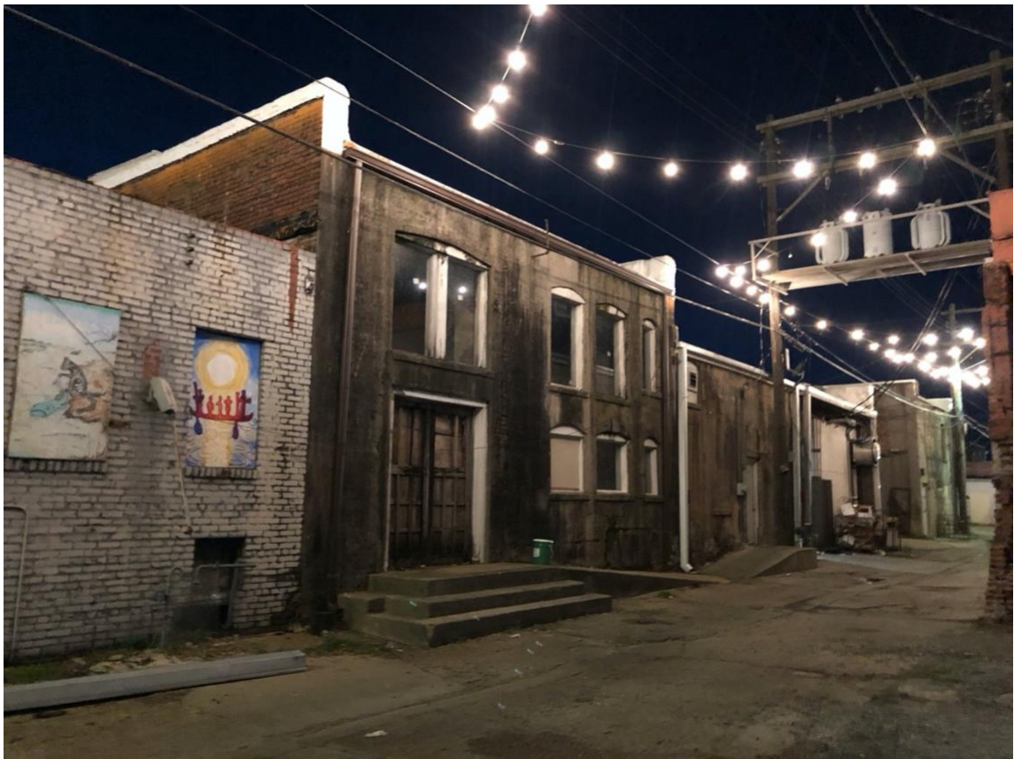
Figure 9 - Back alley behind Bluesberry Cafe where live performances take place

Bluesberry Café is owned and operated by Art and Carol Crivaro from Florida. Bluesberry Café hosts live performances throughout the week serve and host a “Blues and Brunch” every Sunday morning. The Crivaro’s offer a small variety of Italian dishes along with beer and wine. The atmosphere is calmer compared to the other clubs in town that have a ‘whiskey and hell-raising’ vibe.