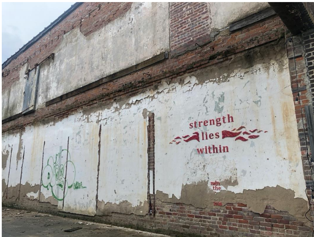
Figure 3 - Graffiti that reads “strength lies within” and dated 2020 on the wall of a crumbling building in Downtown Clarksdale.

restaurants, hotels, gift shops, record stores, museums and many more businesses in this region. In Clarksdale, Mississippi alone, there are around 60 businesses and other entities located downtown which have a relationship with blues and Delta culture (Henshall, 2012). The city of Clarksdale brings an estimated $46 million annually from tourism (Foster, 2020). Other studies of cultural economy have shown that revenues are not distributed evenly among various producers of value, with musicians, artists, and other creators of culture frequently benefiting the least from these economic formations.