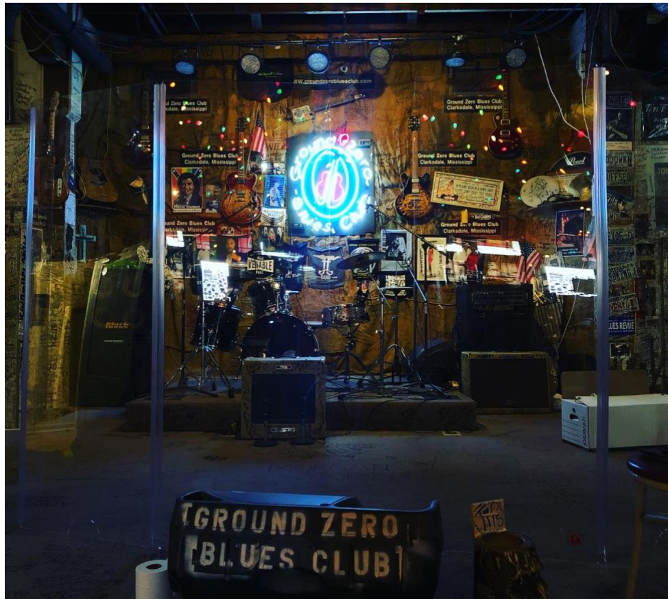
Figure 10 - Ground Zero stage with new plexi-glass partition for their re-opening

Ground Zero holds performances throughout the week where many local blues musicians perform regularly. Luckett, who is also a former mayor of Clarksdale, described to me the atmosphere of the club and the reputation it holds, and explained why it would remain closed for the duration of quarantine until they could once again offer the experience that blues fans come for: