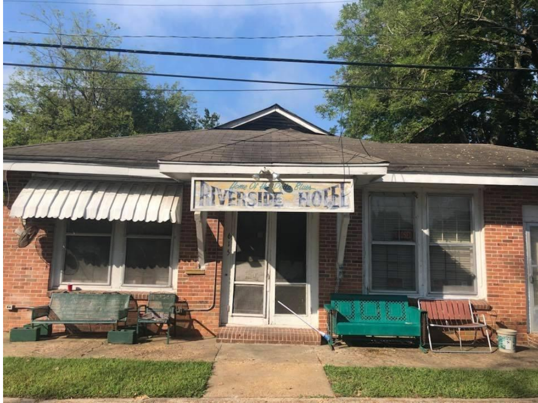
Figure 5 -Riverside Hotel in Clarksdale, Mississippi