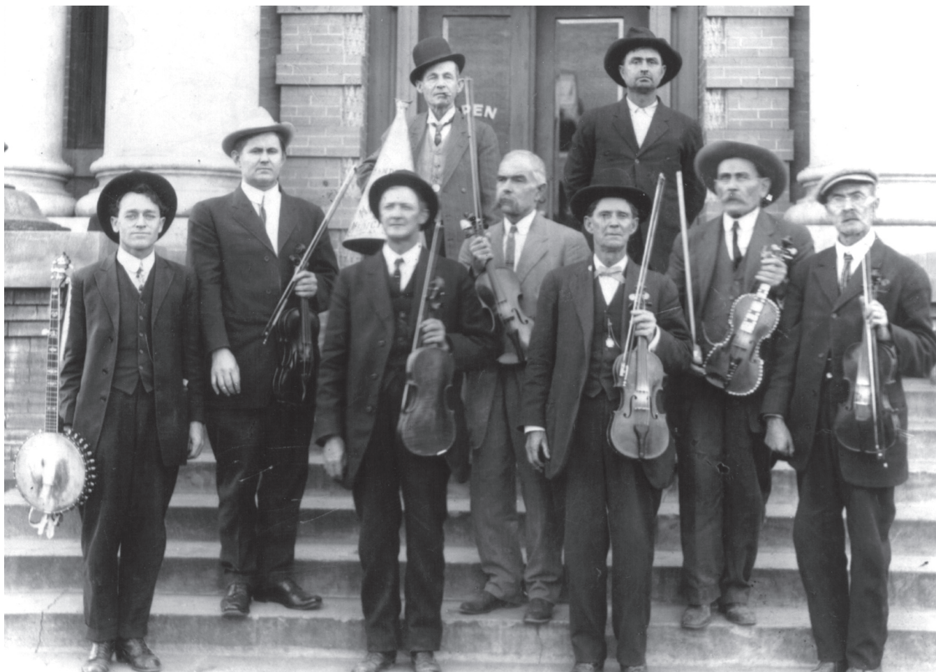
King-K Medicine Company of Cleburne, Texas, circa 1906. The man standing second from the far right with a decorated fiddle is Henry C. Gilliland. He would later gain fame in 1922 after he and fellow Texas-based fiddler Alexander "Eck" Robertson made the first commercial country recording in history.

a lady traveling with a show. One of the brothers, who called himself Doctor, was the barker, and he sure was persuasive. He sold corn cure and liver pills and salve to ease the rheumatism out of aching backs." Though he suffered from stage fright that derailed his debut during his first number, young Orvon Autry went on the road with the show, earning $15 a week. 3