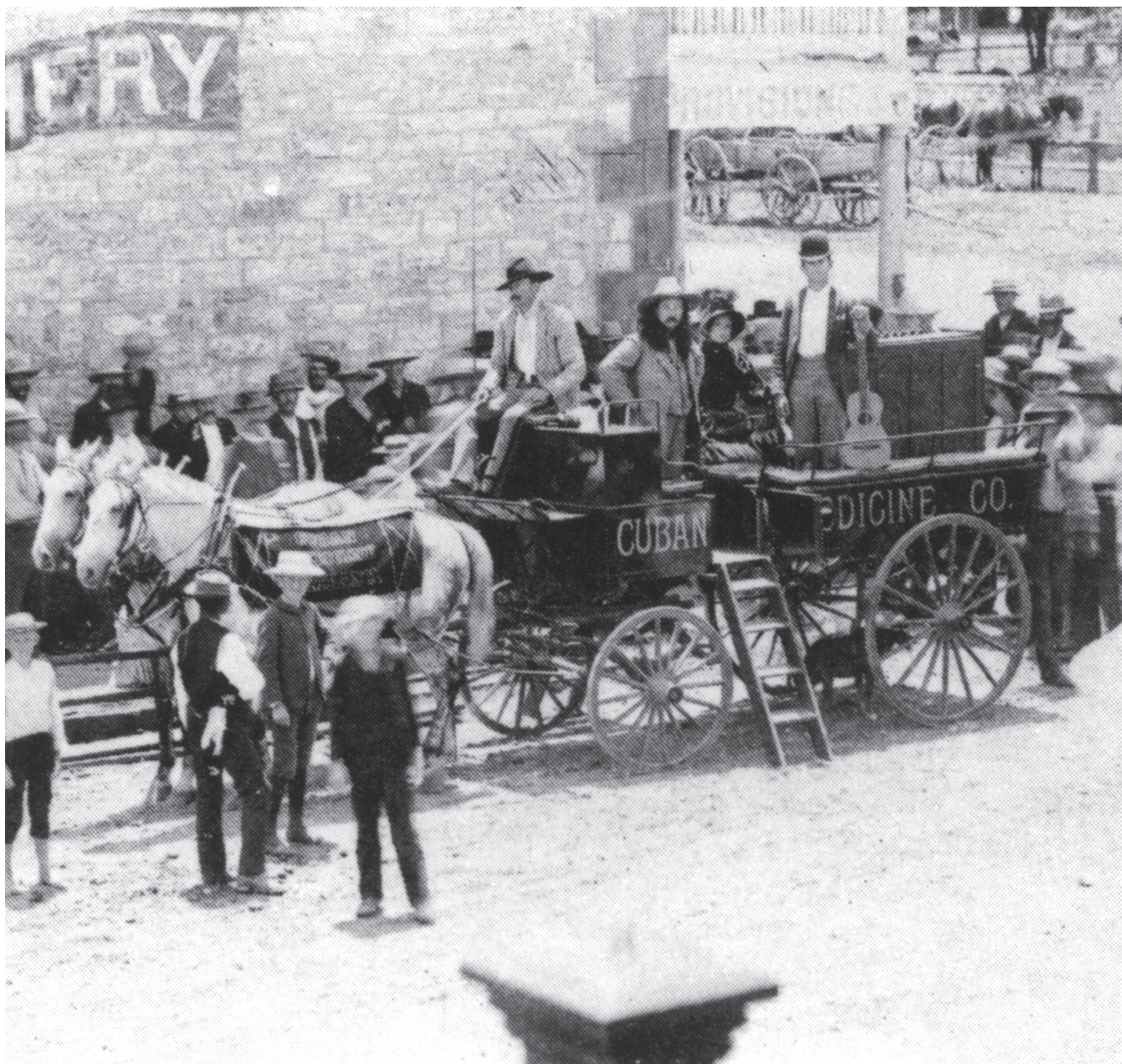
The Cuban Medicine Company of Lampasas, Texas, near the courthouse in Georgetown, Texas, circa 1890.

popularize rock and roll and rhythm and blues (R&B) through programs sponsored by such health products as Pounds On and Pounds Off . One soothing voice offered a nation racked by Cold War-era stress at least some relief from anxiety with the sleep aid Restall . Laxatives and sex aids, staples of 1930s radio advertising, remained just as popular with music-program sponsors during the post-World War II years. In the 1960s, the "howlin'" DJ, Wolfman Jack, blasted many an R&B tune out into the heartland, coupled with a sultry pitch for a potency elixir known as Florex, which was later repackaged as Mr. Satisfy . "This stuff