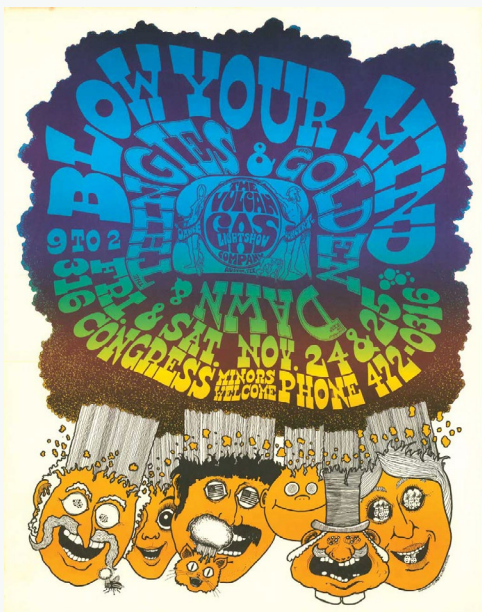
Poster for The Golden Dawn & The Thingies at the Vulcan Gas Company, © 1967, Gilbert Shelton