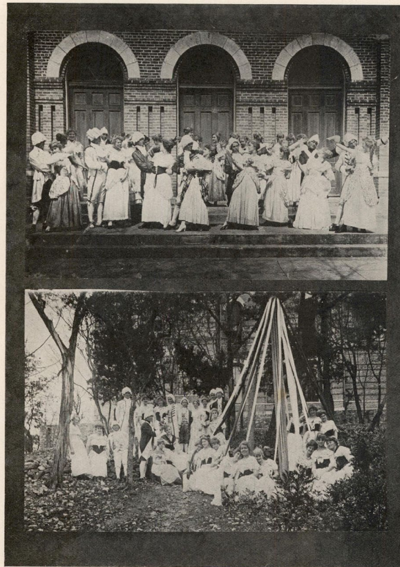
THE STately MINUET THE MAY POLE DANCE

Over the years, as campus expanded, so did the Pedagog . Athletics became a major focus of the yearbook, as well as the on- and off-campus activities of students. Eventually campus grew too big, and became too diverse