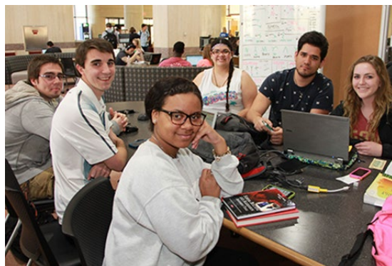
Collaboration Zone Tables on Alkek's main floor

Are you following the Alkek Library Tumblr ? I post study tips (like this guide to choosing your ideal study spot ) regularly, as well as subject-specific news and articles.