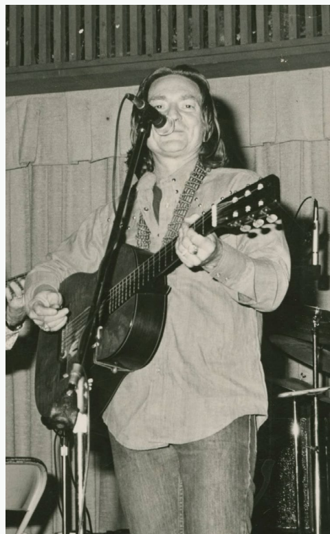
Willie Nelson playing in Austin, ca. 1974

Armadillo Rising: Austin's Music Scene in the 1970s complements Homegrown , showcasing treasures from the Wittliff's extensive collections on Willie Nelson, Jerry Jeff Walker, and Austin City Limits , among others.