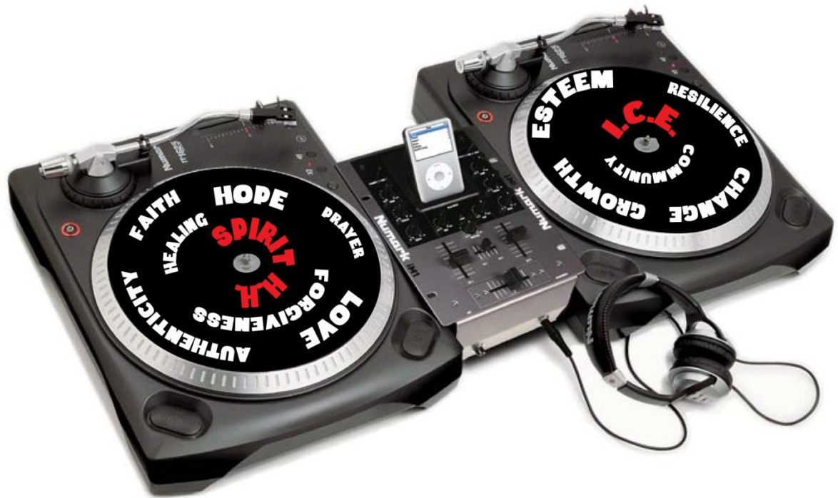
Figure 1. Conceptual Framework “The Turn Table”

middle of the turntable is an MP3 player, and this MP3 player symbolizes the literature that informed this study. One turntable has on it the theoretical framework of this proposed study and is entitled: the Individual and Community Empowerment framework mix tape. This consists of the five components of ICE, which are esteem, resilience, growth, community and change (Travis & Deepak, 2010). The second turntable holds the Spiritualizing Hip Hop mix tape consisting of themes from Hip Hop and spirituality that emerged from the literature.