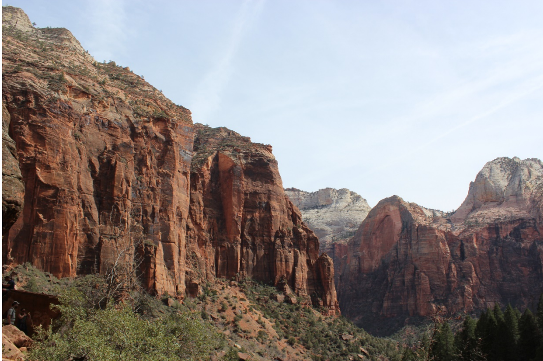
The sun shines high on the mountains in Zion.