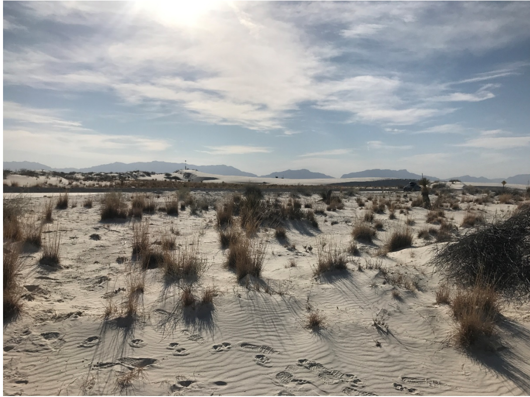
The sun reflects off the sand at the White Sands Monument in Alamogordo, New Mexico.

It was March 11 th – just one day away from our Southwest road trip. We made