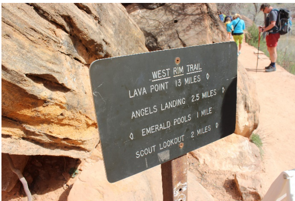
Signs throughout the trails help guide hikers through the mountains of Zion.

Kayenta Trail, we needed to get off at stop six – The Grotto. The Kayenta Trail was on the moderate scale: about one-and-a-half-hours or 2 miles round trip per our trusty map. The view was amazing. I suddenly felt like Ansel Adams, taking photos of the canyon made by the Virgin River and the pools that seemed to appear out of thin air. I scouted for college students to talk to about my thesis. Occasionally there was a young adult couple, moving