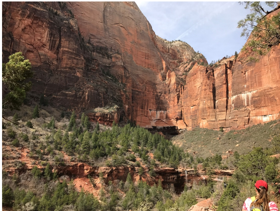
The mountains vary in color due to years of water erosion.