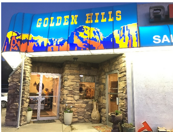
Golden Hills Motel and Restaurant is in Mt. Carmel, just outside of Zion National Park.

Onward to the Watchman Campground in Zion where we’d reserved a non-electric campsite for the evening for $20. As we drove further into Utah, our food options became limited. We passed through the little town of Mt. Carmel, Utah, and ate at Golden Hills Motel & Restaurant per the recommendation of the gas station attendant across the way.