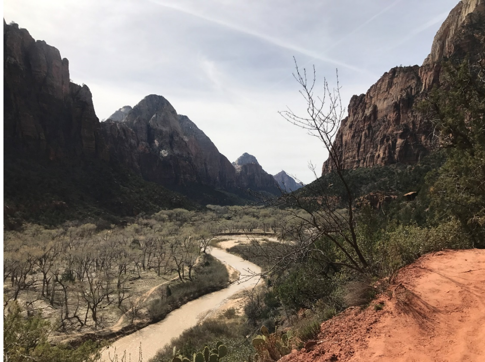
The Virgin River below is responsible for the creation of the park.