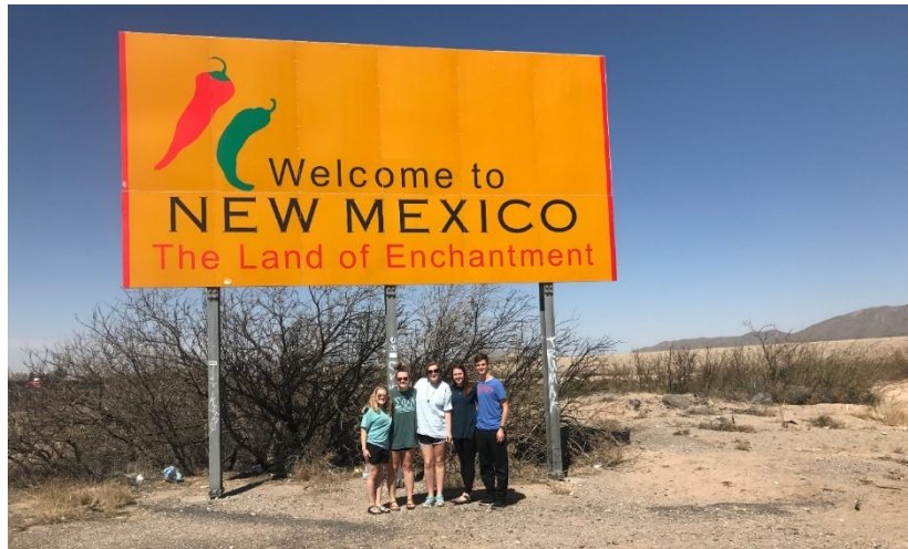
A fellow traveler takes our group photo at the border of Texas and New Mexico.

About an hour left until Alamogordo – the town that claims the White Sands Monument. We had to stop for gas before we entered the park. The first gas