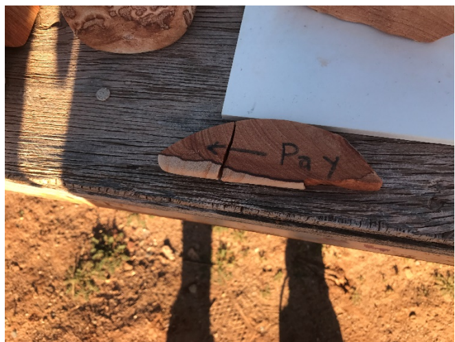
A written note on a rock directs customers to pay.

One hour and 27 minutes until the Utah border at Kanab. We stopped, per tradition, to take our group photo at the border. As we pulled up we noticed tables set up near the stateline sign, with hand-made paperweights, arches, business card holders, hot plates, pendants, dice, geodes and soap dishes. There was no attendant, but instead we were met with a rock with a written note indicating where we could direct our payment for the goods. A simple instruction, “Pay,” was written in sharpie with an arrow pointing to a nearby metal box. “What an honor system!” Eric proclaimed. No kidding! Out of curiosity, we peeked