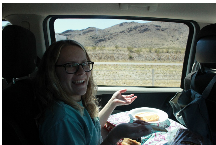
Using pillow as a table, I make a peanut butter and jelly sandwich for lunch.

When I woke, we were seven hours out from White Sands Monument – our first destination. We turned off the GPS and decided to cruise the 400 miles before our next