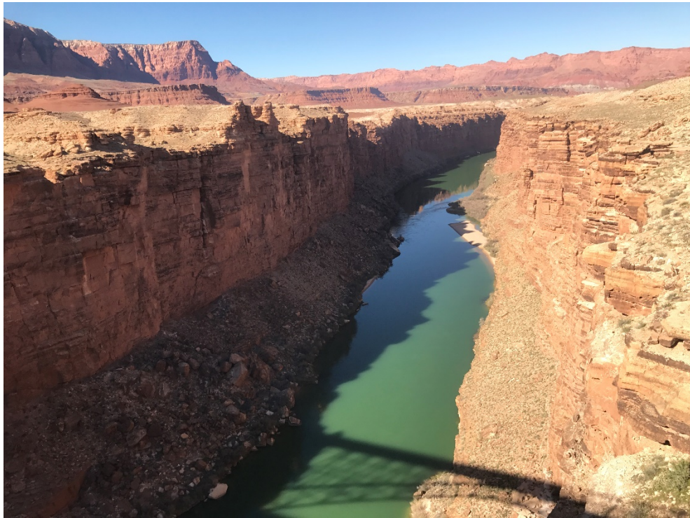
The bridge connects the land bordering the Colorado River.

One hour and 27 minutes until the Utah border at Kanab. We stopped, per tradition, to take our group photo at the border. As we pulled up we noticed tables set up near the stateline sign, with hand-made paperweights, arches, business card holders, hot plates, pendants, dice, geodes and soap dishes. There was no attendant, but instead we were met with a rock with a written note indicating where we could direct our payment for the goods. A simple instruction, “Pay,” was written in sharpie with an arrow pointing to a nearby metal box. “What an honor system!” Eric proclaimed. No kidding! Out of curiosity, we peeked