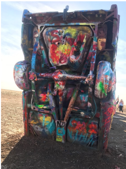
No part of this Cadillac was left without paint.

by about 5 p.m. after our stop at Cadillac Ranch. When I checked us in, instantly I could