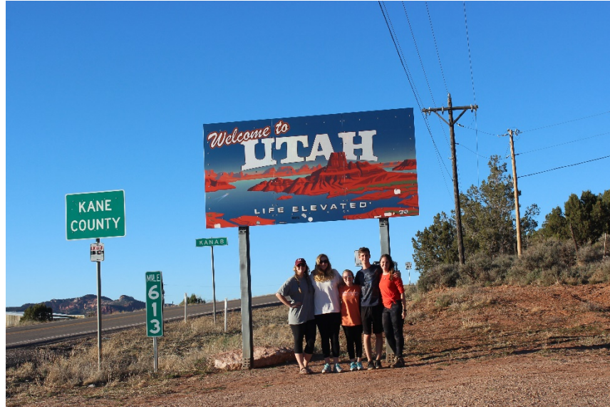
We snapped a group photo at the Utah border before heading to Zion National Park.