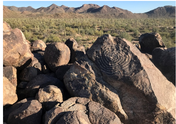
On the left: The trailhead for Signal Hill trail at Saguaro National Park. On the right: a petroglyph at the peak of Signal Hill.