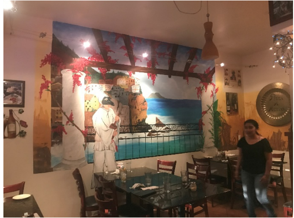
The mural in Pizza a Metro restaurant in Phoenix, Arizona.

Walter waited where we'd left him, and onward we drove toward Days Inn Flagstaff – West Route 66 , our motel for the evening. With our trusty Google Reviews in hand, we decided to stop and eat at Pizza a Metro, a local pizza joint in Phoenix where we ordered a 39" pepperoni brick-oven pizza the size of our