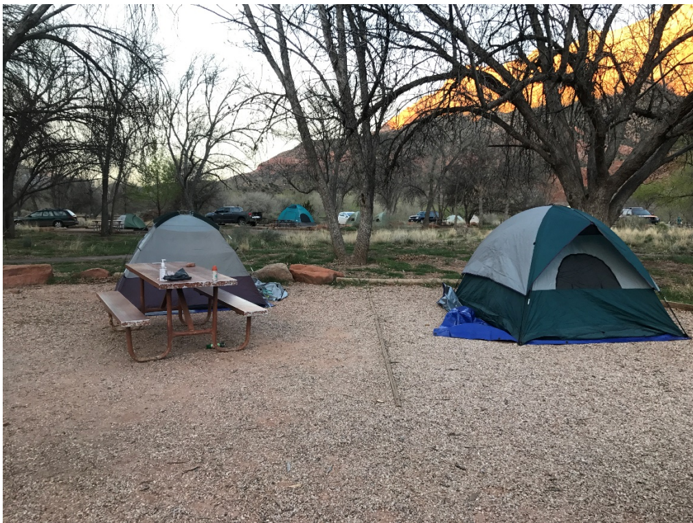
Campsites were provided a table, and space for two tents.