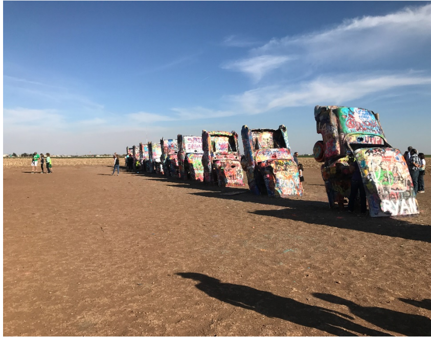
Commissioned as an art piece in 1974, Cadillac Ranch features 10 Cadillacs buried in the ground.