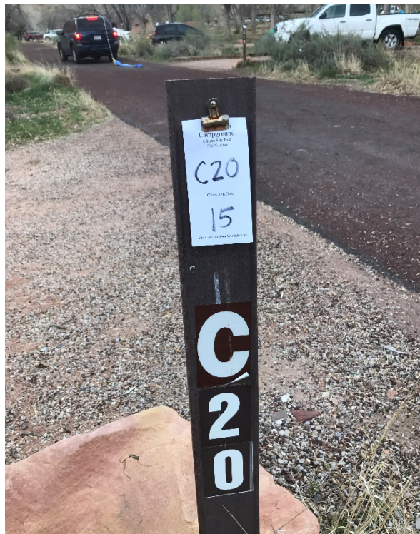
Each campsite was identified by a campsite number.