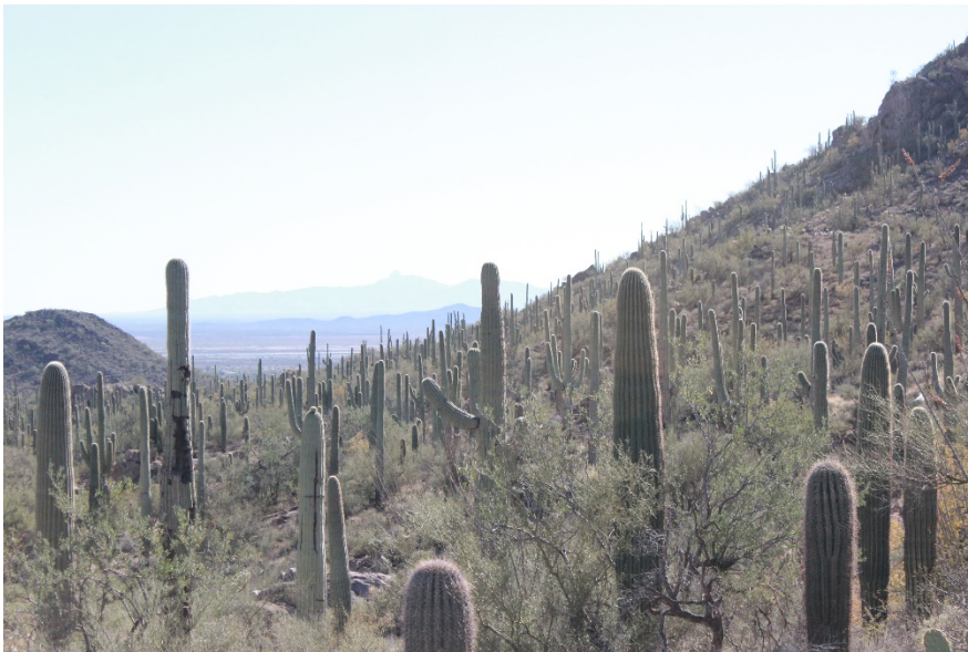
Nearly 40-foot cactuses go for miles at the top of the Overlook Trail in Saguaro National Park.