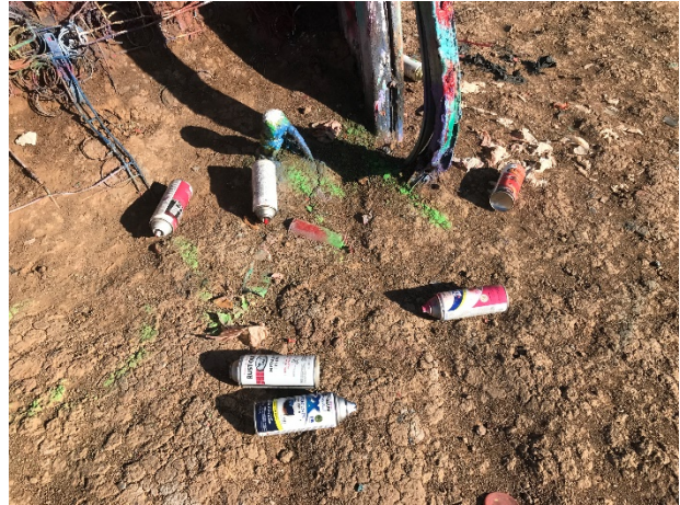
Visitors leave empty spray paint cans at the exhibit.