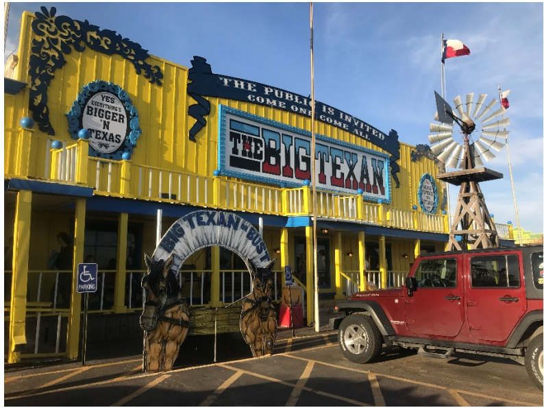
The Big Texan Steak Ranch & Brewery is off I-40 in Amarillo.

and bars to choose from. Our hunger was stronger than our desire to wait for a table in the popular main dining room, so we settled on a smaller version near the bar. Live musicians serpentine between the tables for tips while we waited to be served. The meal wasn't cheap, but it was satisfying. We decided against ordering their legendary 72 oz. steak (that's four and half pounds), but my 8-oz.