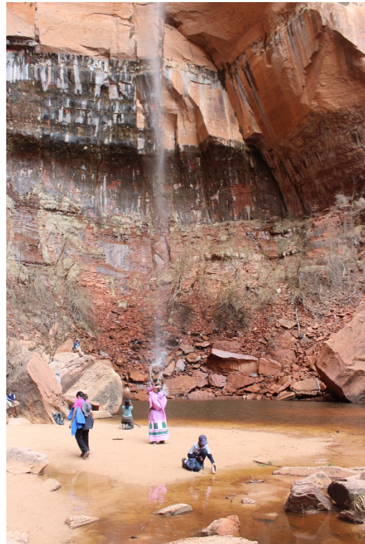
Left: Balancing the camera on a rock, the group takes a photo with the waterfall above the pool. Right: tourists admire the waterfall above the Upper Emerald Pools.