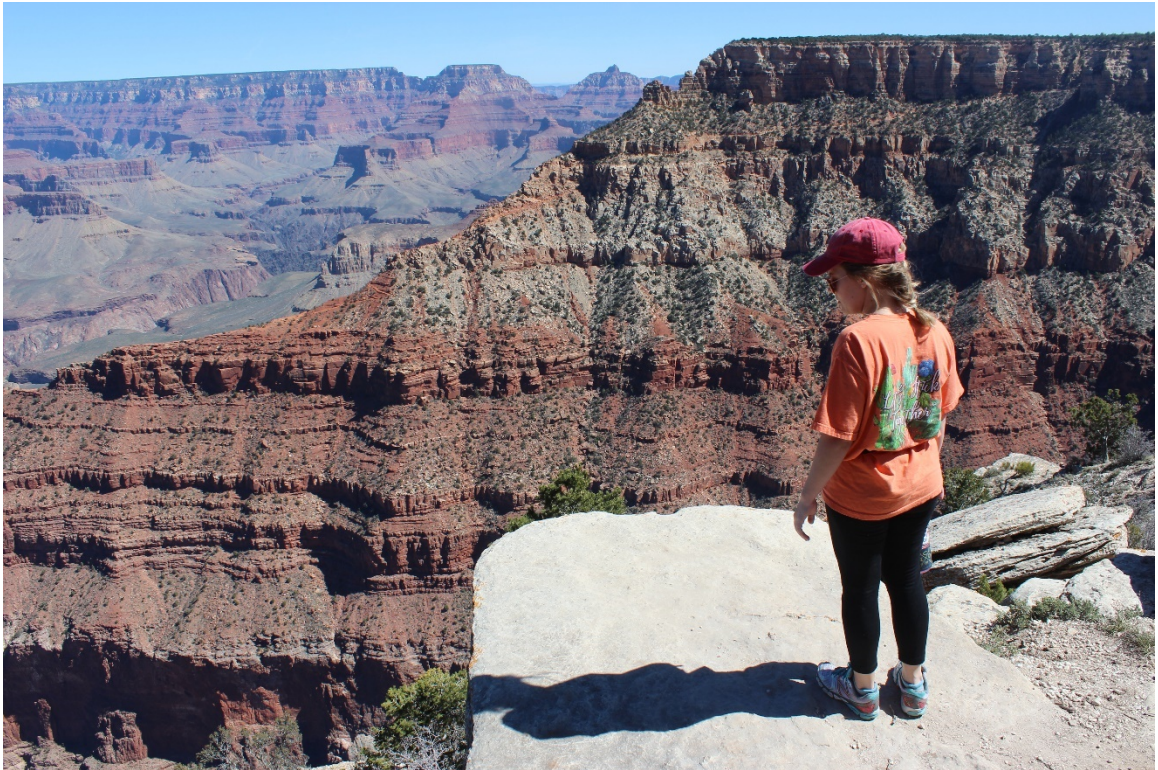
Standing at the edge of the Grand Canyon.

We awoke ready for our second free breakfast, but at 8:30 a.m., all that was left were four pieces of toast, cereal, a few apples, one English muffin and over 20 hungry guests waiting in line. Instead we decided on a nearby Dunkin Donuts and Chick-fil-A off Route 66 for breakfast. Only an hour and 30 minutes separated us from today's destination: Grand Canyon National Park. I offered to drive us into the park, as this was one of our shorter drives of the trip and the other can only sit in the back for so long. We had to fill up on gas by the time we arrived, which was a whopping $50 at over $3 a gallon. In retrospect, we should have filled up before entering the resort area.