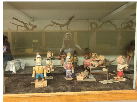
Hand carved trinkets were featured in glass display cases.