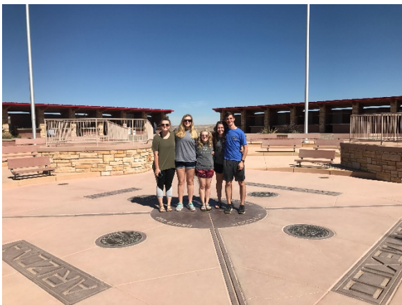
A fellow tourist offers to take our group photo.

arrived. There was supposed to be over an hour wait to pose for a photograph on the crest