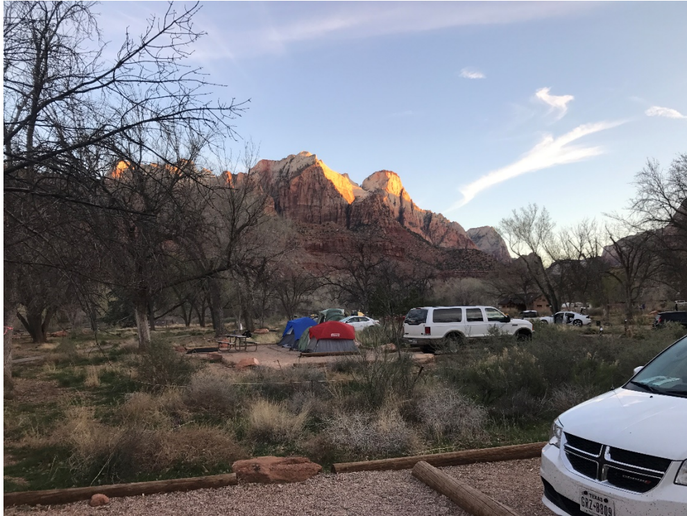
The sun peaks over the Watchman Campgrounds the morning of March 15.