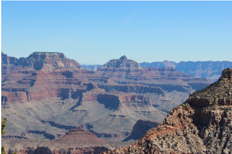
Miles of canyons fill the national park.