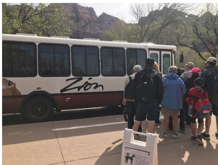
Hikers and tourists wait in line to board the shuttle.

Before setting off on a hike, we packed up camp and drove to the Zion Canyon Visitor Center to catch a shuttle bus. The bus arrives approximately every 15 minutes, and