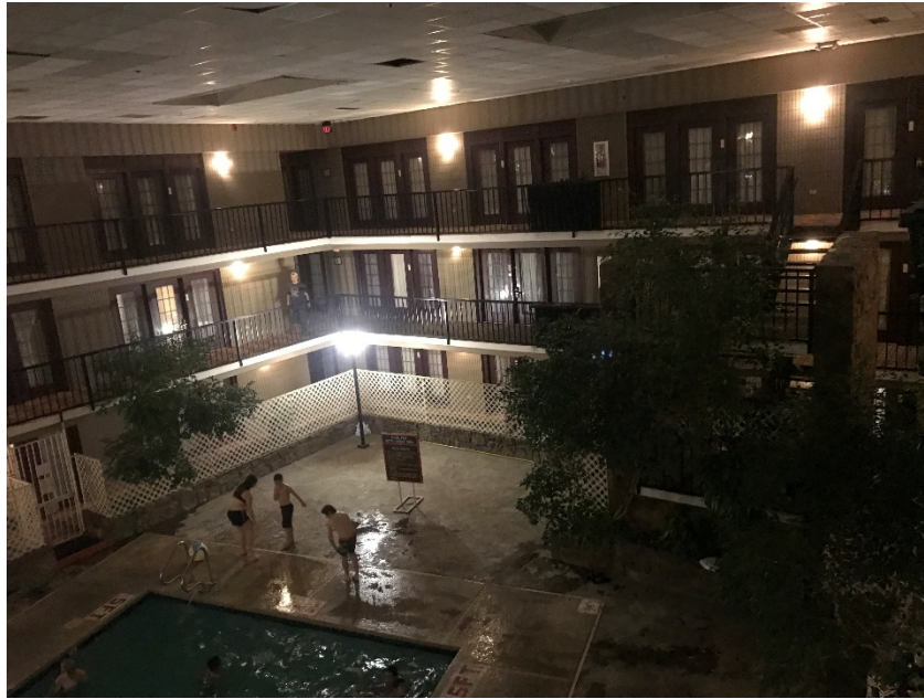
Children played in the pool inside the lobby.

were borrowed from someone's home. The ceiling in the bathroom looked like they might need to attend to some minor areas of loose drywall and potential mold, but at $46 a night, we weren't complaining. It's supposed to be an adventure, right?