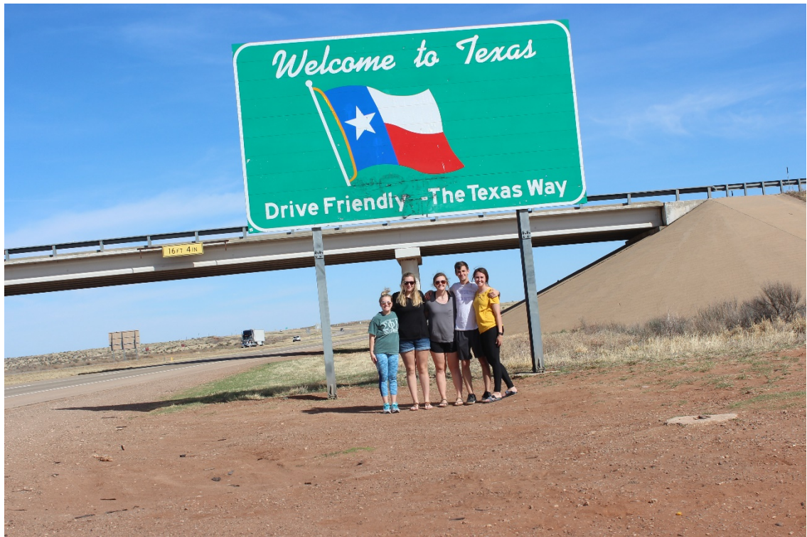
We take one last border photo, and then head home to San Marcos.

provided connection. Much like American citizens back in the day, we went out searching – to see what was in our own backyard, to search for that experience or that feeling. We went to connect. And in today’s world, maybe a little more connection isn’t such a bad idea.