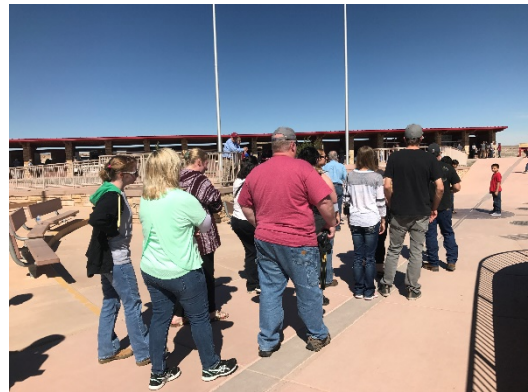
Tourists wait in line to take their picture on the crest.