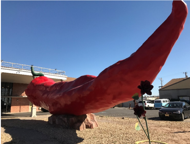
The world's largest Chili Pepper is located in Las Cruces, New Mexico.