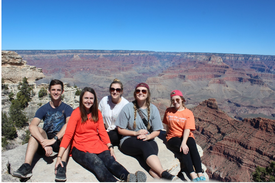
The group sits at the edge of the Grand Canyon.