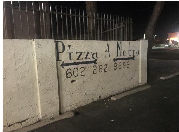
Pizza a Metro is located off West Thomas Road in Phoenix.

table for $27. A hand-painted mural of the Italian coast and soft music set the mood of the bistro. Through the window into the kitchen, we watched the chef roll and toss the dough. He slid in our pizza in the pizza using a pizza peel, the large wooden paddle used to place the pies directly in the oven. We split the pizza between the 5 of us and split the bill using Venmo .