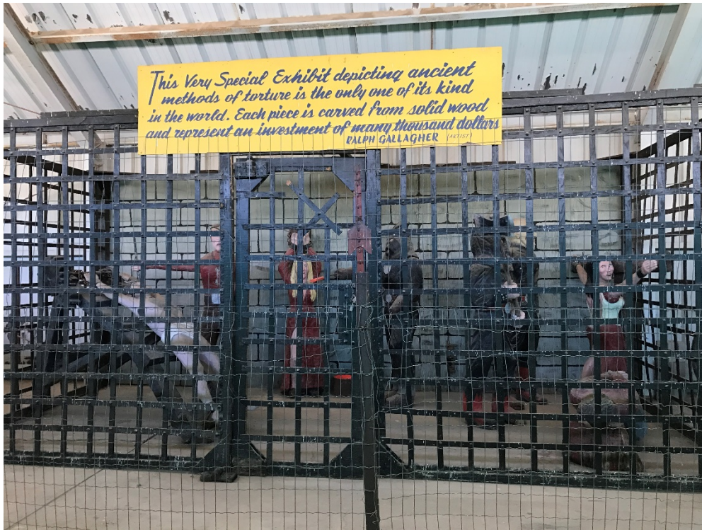
A metal display depicted sculptures of ancient forms of torture.