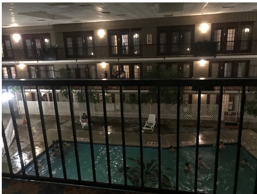
We had a view of the pool from the balcony outside our room.