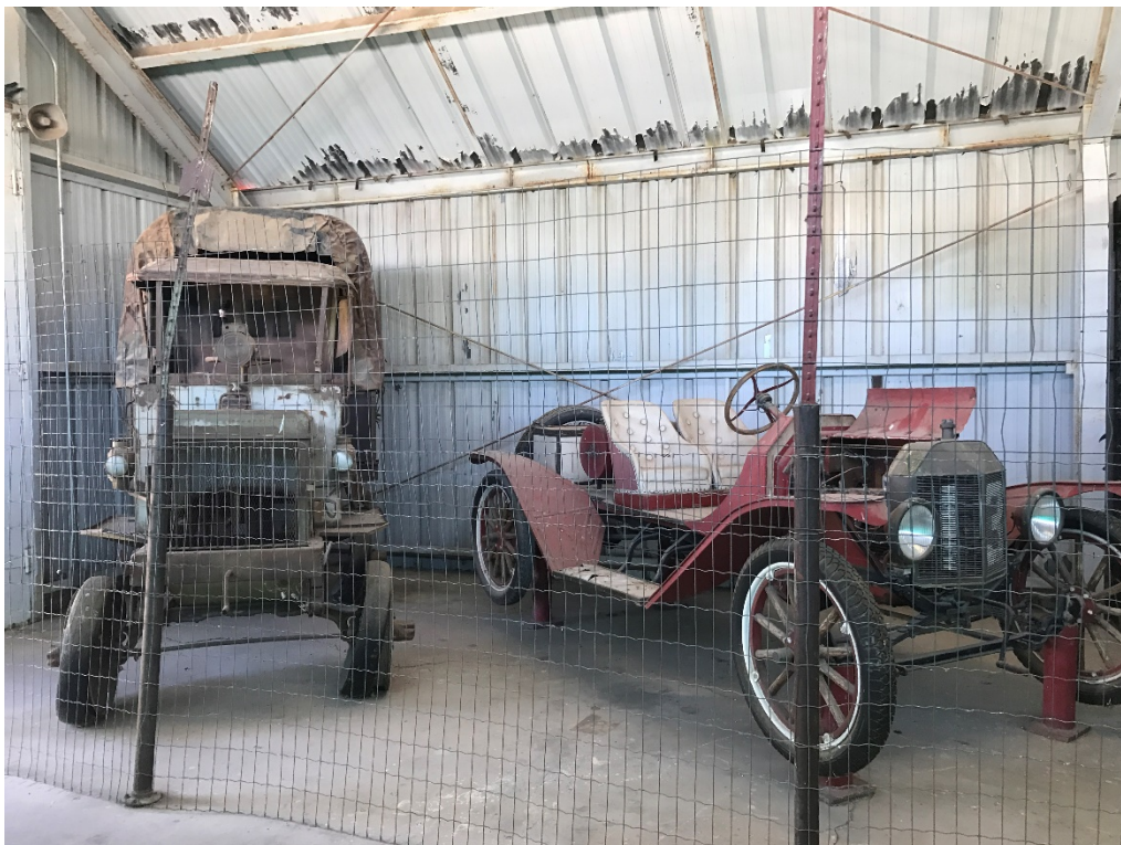
Old automobiles from the late 19th and early 20th centuries.