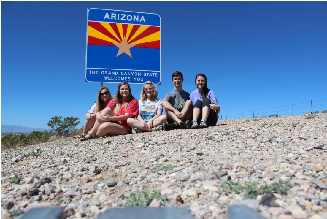
On day two, we stopped for a group photo at the New Mexico and Arizona border.

Three words: free continental breakfast. We weren't on as tight of a schedule today, so we slept in until 8:30 a.m. We made our way down to the lobby in our pajamas where they were serving breakfast. While waiting in line for breakfast, I struck up a conversation with a fellow bagel lover. She was from Dallas and in town for a baseball tournament for a family member. Another gentleman from Dallas stopped by our table after noticing we were wearing Texas State and UT T-shirts. He was a Texas A&M University Aggie. "That's too bad!" he joked as he made his way to his table.