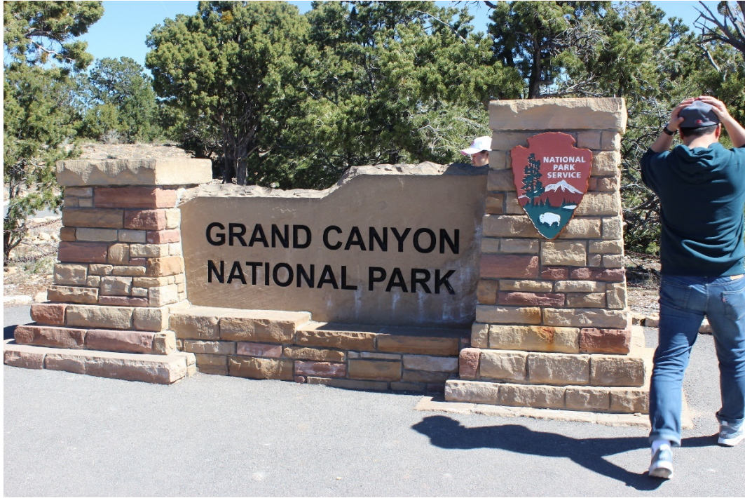
The Grand Canyon National Park sign at the Visitor's Center.