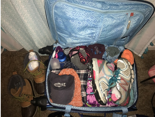
Everything but hiking boots fit in my suitcase.

We checked off our lists. We had the food, the supplies, the van, and the adventurers — all that was left? Packing . Ugh. We planned to be driving away at 6 a.m., which meant