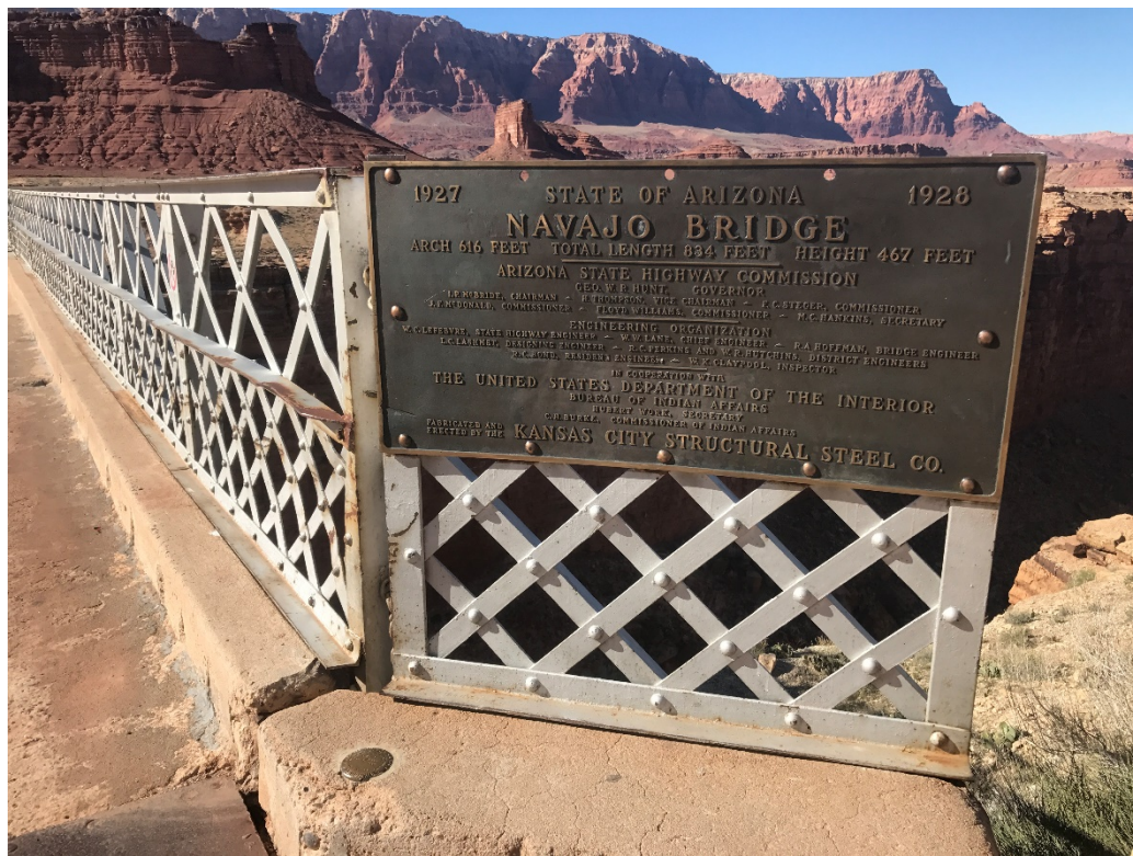
The Navajo Bridge was built in 1927 in Kanab, Arizona.

Because road trips never stay on schedule, we were forced to cut out our next roadside attraction: The Moenkopi Dinosaur Tracks in Tuba City, Arizona. We would have had to take a guided tour out to the tracks, so for the sake of time we decided to visit the Navajo Bridge in Marble Canyon, Arizona, instead. The bridge was gorgeous, only appearing after a long and winding road through the back canyons of the state. It stood 467 feet above the Colorado River. It turned out to be a fun pit stop for a photoshoot.