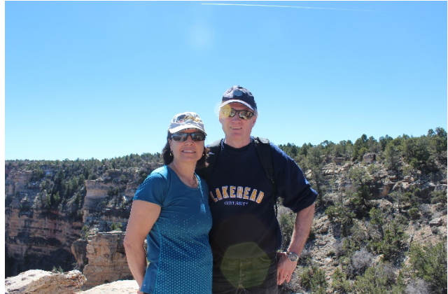
A couple pose for a portrait at the Grand Canyon.

little as one to two hours or those who had all day to hike the trails. My old roommate, and her family hiked the Grand Canyon the summer before, approximately an 18-hour hike round trip by the time they'd gotten to the bottom, camped and hiked back out the next day. Since we knew we'd be doing most of our hiking in Zion, we settled for a two-hour hiking trail in Grand Canyon. We were instructed to go to