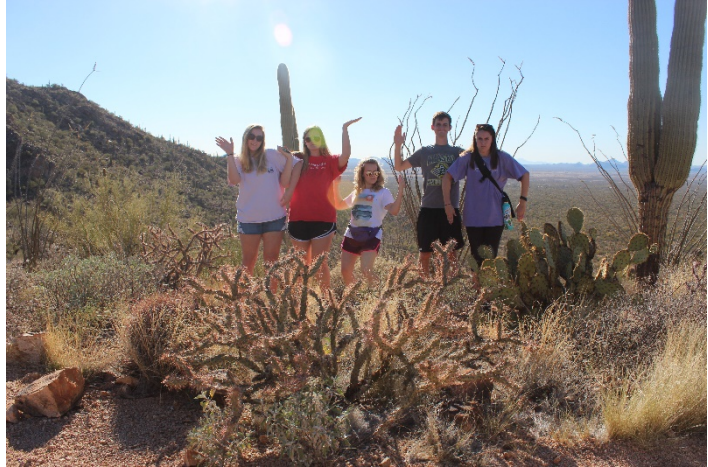
The group blends in to their surrounding posing as cactuses.