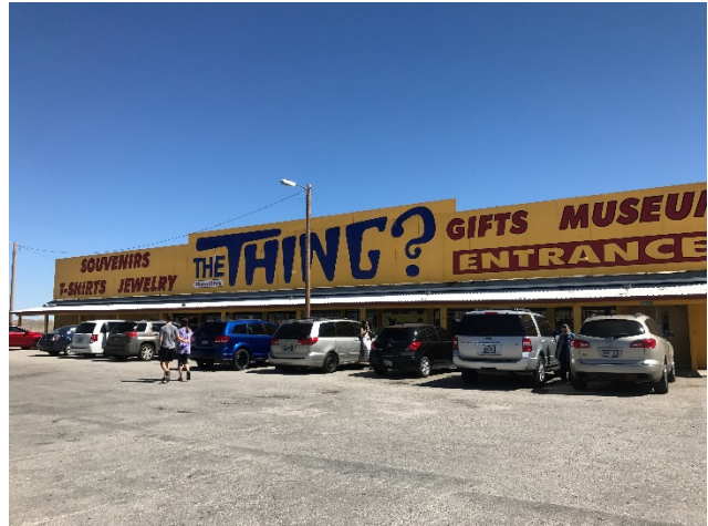
The Thing is located just off I-10 in Dragoon, Arizona.

On the way to Saguaro, we gave in to my childish ambition and pulled off to follow the signs for “The Thing.” Others who’d been before said it wasn’t worth the stop – that it literally measured up to the word “underwhelming.” Deciding not to heed their advice, it was only $1 to see