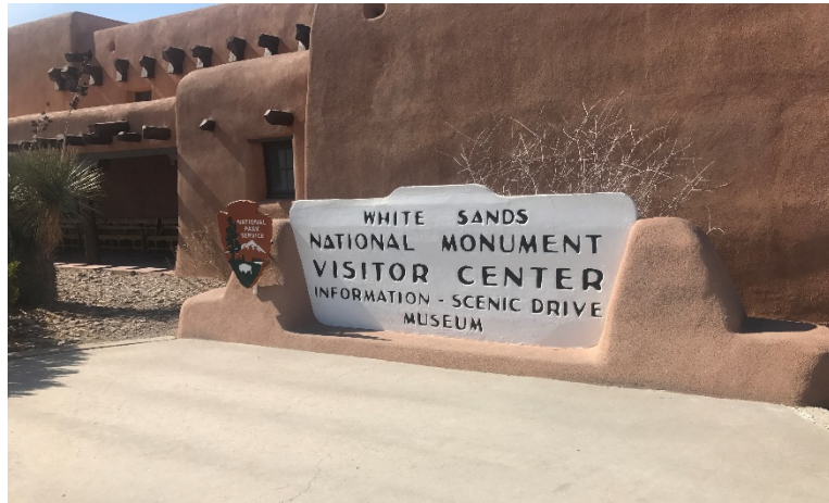
Entrance to the visitor center at White Sands National Monument in Alamogordo, New Mexico.

She said the whole drive throughout the park was about 16 miles in total, and after a few miles inside the Monument, we could park and explore on foot.