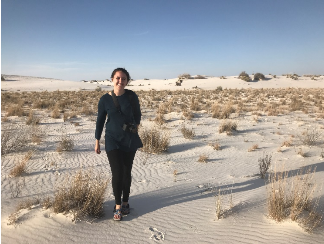
Sydney walks along the sand dunes.

world, a mineral left behind 250 million years ago by the Permian Sea, according to NPR . I thought briefly that I should have brought a jar or something to take back a handful as a souvenir, but the removal of any of the monument's natural resources is prohibited .