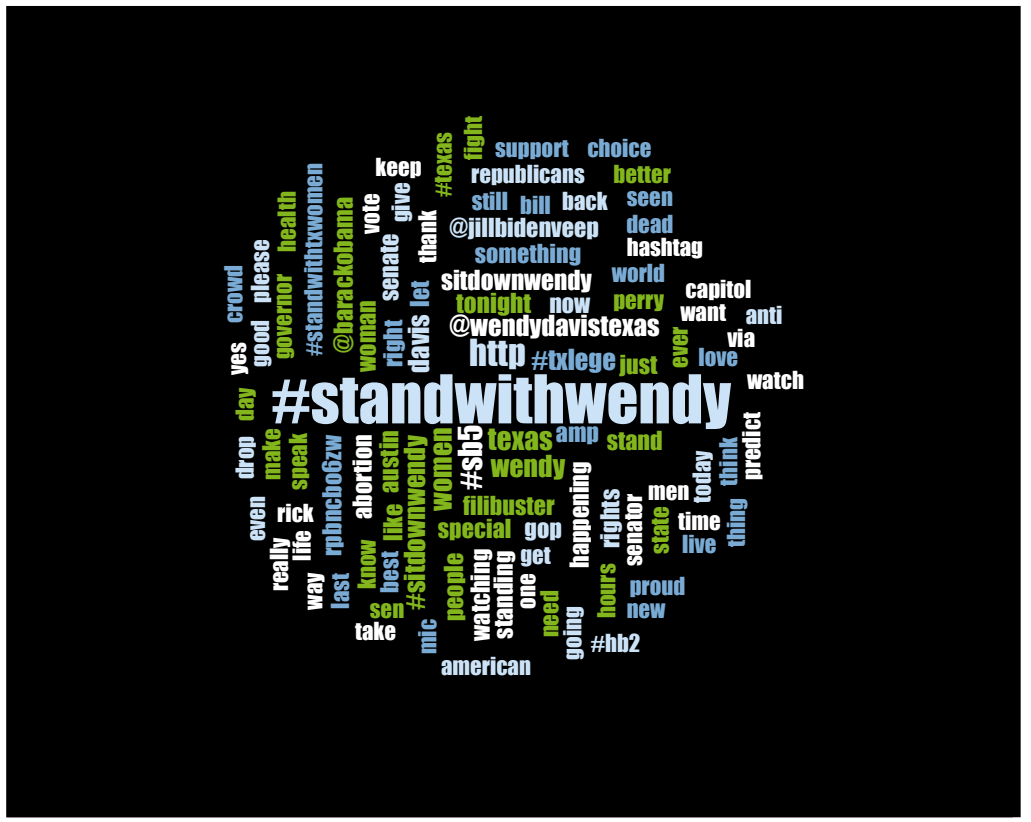
Figure 1: NVivo Word Cloud

Word cloud is generated from the data of both #StandWithWendy and #SitDownWendy.