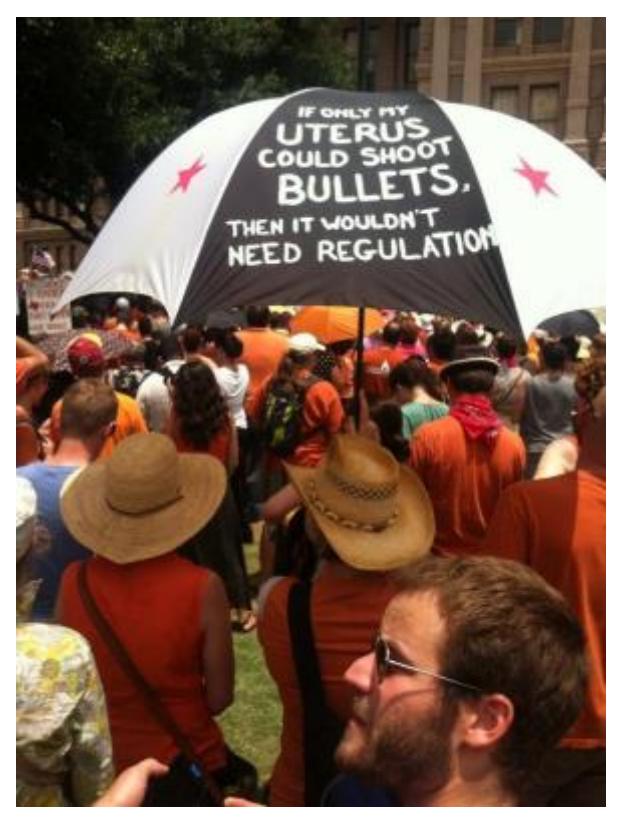
Figure 1: Photo from #StandWithWendy data set (Phillips, 2013)

One common visual that supporters used was a picture of people attending the rally wearing orange, and holding an umbrella that said "If only my uterus could shoot bullets, then it wouldn't need regulation."