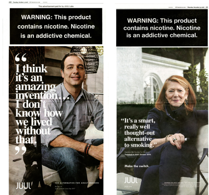
Figures 5 & 6. Switch Campaign . Photographs published by Juul Labs. Images sourced from the Switch Collection, Stanford Research into the Impact of Tobacco Advertising, Stanford University, https://tobacco.stanford.edu/pods/juul/switch/

Comparatively, Juul's 2018 Switch campaign focuses on a markedly different target segment than the company's Vaporized campaign. In Figures 5 and 6, the models are older, and the colors used cool and neutral tones. The clothing used denotes a mature atmosphere. Words like "smart... alternative" and "amazing invention" indicate user satisfaction and send the meta message that consumers of JUUL products place themselves among other intellectual adults who have switched.