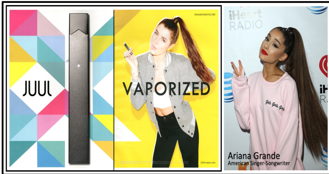
Figure 4. Vaporized Campaign . Photograph (left) published by JUUL Labs. Image sourced from the Vaporized Collection, Stanford Research into the Impact of Tobacco Advertising, Stanford University, https://tobacco-img.stanford.edu/wp-content/uploads/pods/juul/vaporized/vaporized_50.jpg

Although Figure 4 from the Vaporized campaign follows the trends of bright colors and young models, the noteworthy element in this image is the hairstyle that the model wears: A high ponytail, iconic of the singer Ariana Grande during 2015. The iconography of Grande was notably relevant within the youth zeitgeist, especially with teens who idolize the performer regularly adopting the “Ariana pony.” The model hits her JUUL while striking a pose reminiscent of Grande on the red carpet (fig. 4, right).