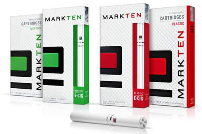
Figure 7.

The initial ENDS devices often appealed to tobacco smokers by taking on a recognizable cigarette appearance. In August 2014, Altria Group launched the MarkTen, the tobacco company's initial ENDS product investment which adopted a familiar design shaped after an average cigarette. 11 For a product designed to lure in current cigarette smokers, a classic cigarette shape makes good marketing sense.