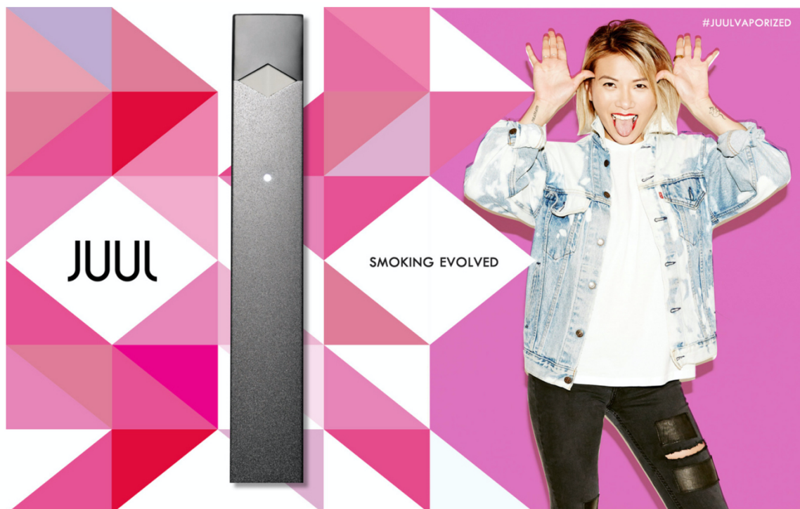
Figure 2. Vaporized Campaign . Photograph published by JUUL Labs. Image sourced from the Vaporized Collection, Stanford Research into the Impact of Tobacco Advertising, Stanford University, https://tobacco-img.stanford.edu/wp-content/uploads/pods/juul/vaporized/vaporized_5.jpg

Content analysis of vape advertisements from this time indicate the campaign's target demographic at its launch. In 2015, JUUL launched its Vaporized campaign. Advertisements of this time followed a notably youth-focused theme that utilized bright colors, and pictures of 20-somethings laughing, smiling, and using JUULs.