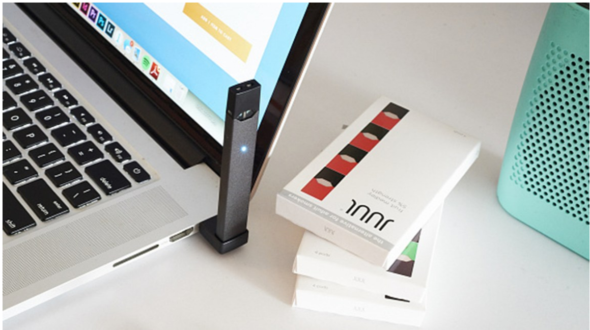
Figure 8.

Comparatively, JUUL’s sleek design allowed the company to penetrate the youth market, beginning with the shape of the product. A JUUL vape device appears quite similar to a USB memory stick, and it can be charged in the USB port of a computer (see fig. 7). It is composed of two mechanisms: the battery system and the prefilled nicotine pod which doubles as the mouthpiece. As parents soon learned, the newer device would not look out of place in a school backpack, especially given that many students must carry a USB flash drive for class assignments. Additionally, students could covertly charge their JUUL devices in the classroom.