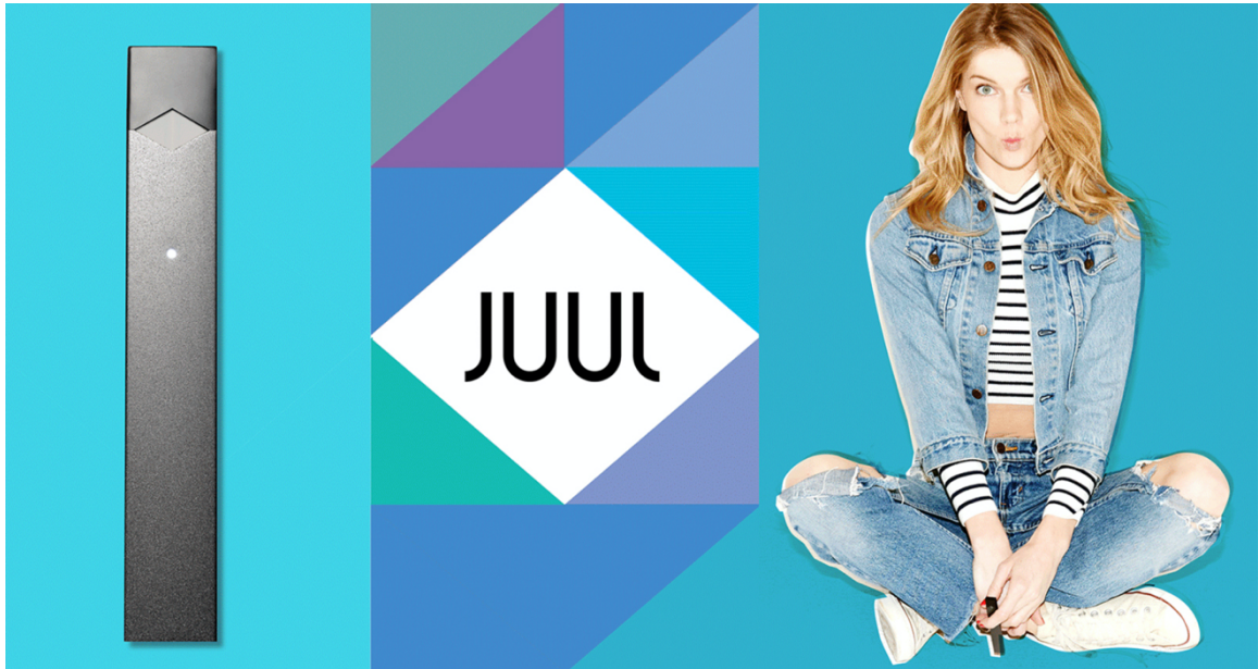
Figure 3. Vaporized Campaign .

In another Vaporized campaign ad, a young model holds a Juul product while making “duckface” and sitting on the floor in a notably childlike pose (see fig. 3). The clothing chosen for this model follows trends that were largely popular among tweens and young adults, including a horizontal striped crop top, distressed jeans, and white Converse. Makeup is minimal and natural with soft pink lip gloss and feathered brows.