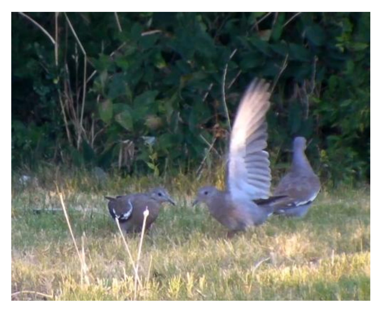
Figure 4. White-winged Dove opposite side wing-raising.