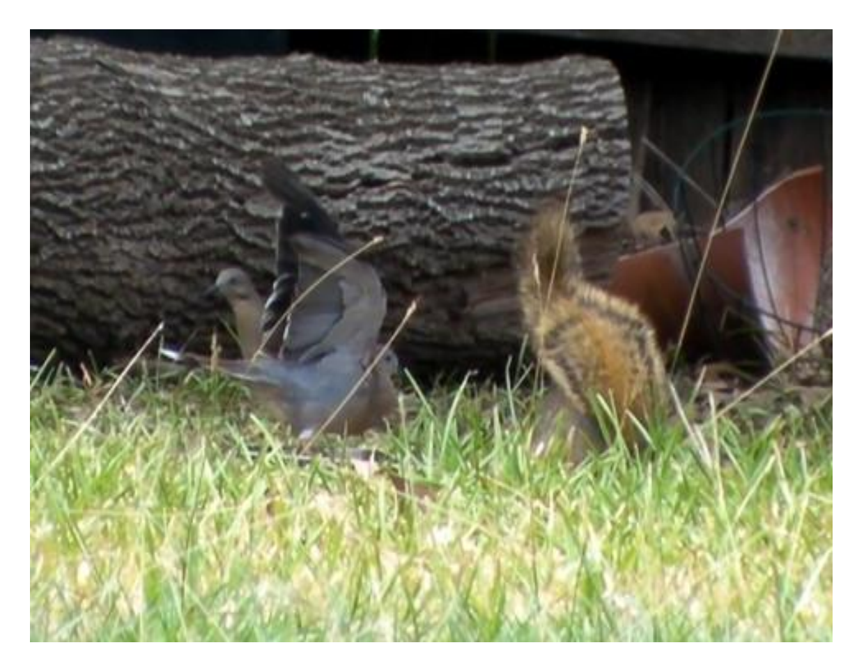
Figure 5. White-winged Dove raising both wings to fox squirrel.