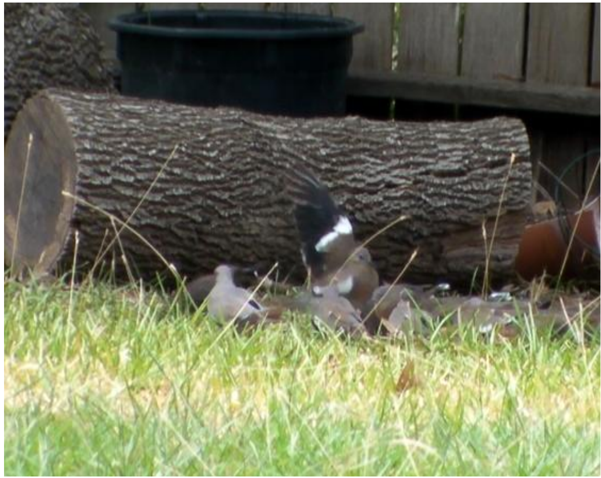
Figure 1. Wing-raising behavior by White-winged Dove.